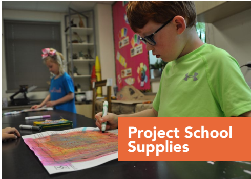
Project School Supplies

Project School Supplies provides economically-disadvantaged students at both Title I and non-Title I campuses the supplies they need to begin the school year. Our donors make it possible for all SBISD students to begin the year with the tools critical for success in the classroom.