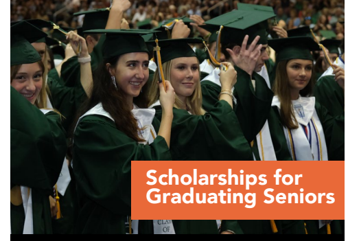
Scholarships for Graduating Seniors

Through grants , funding is offered to support SBISD students as they explore a variety of skills and interests that could lead to future careers. From reading to writing to cooking to technology to art, our grants offer the district and our teachers funding to help our students work towards their goals for the future.