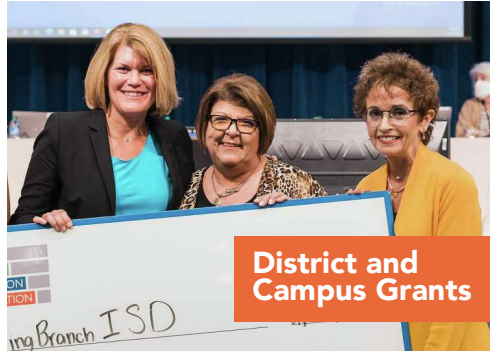
District and Campus Grants

Project School Supplies provides economically-disadvantaged students at both Title I and non-Title I campuses the supplies they need to begin the school year. Our donors make it possible for all SBISD students to begin the year with the tools critical for success in the classroom.