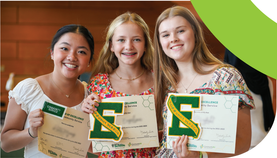
Edina High School students receiving their Community Service Awards and Letters.