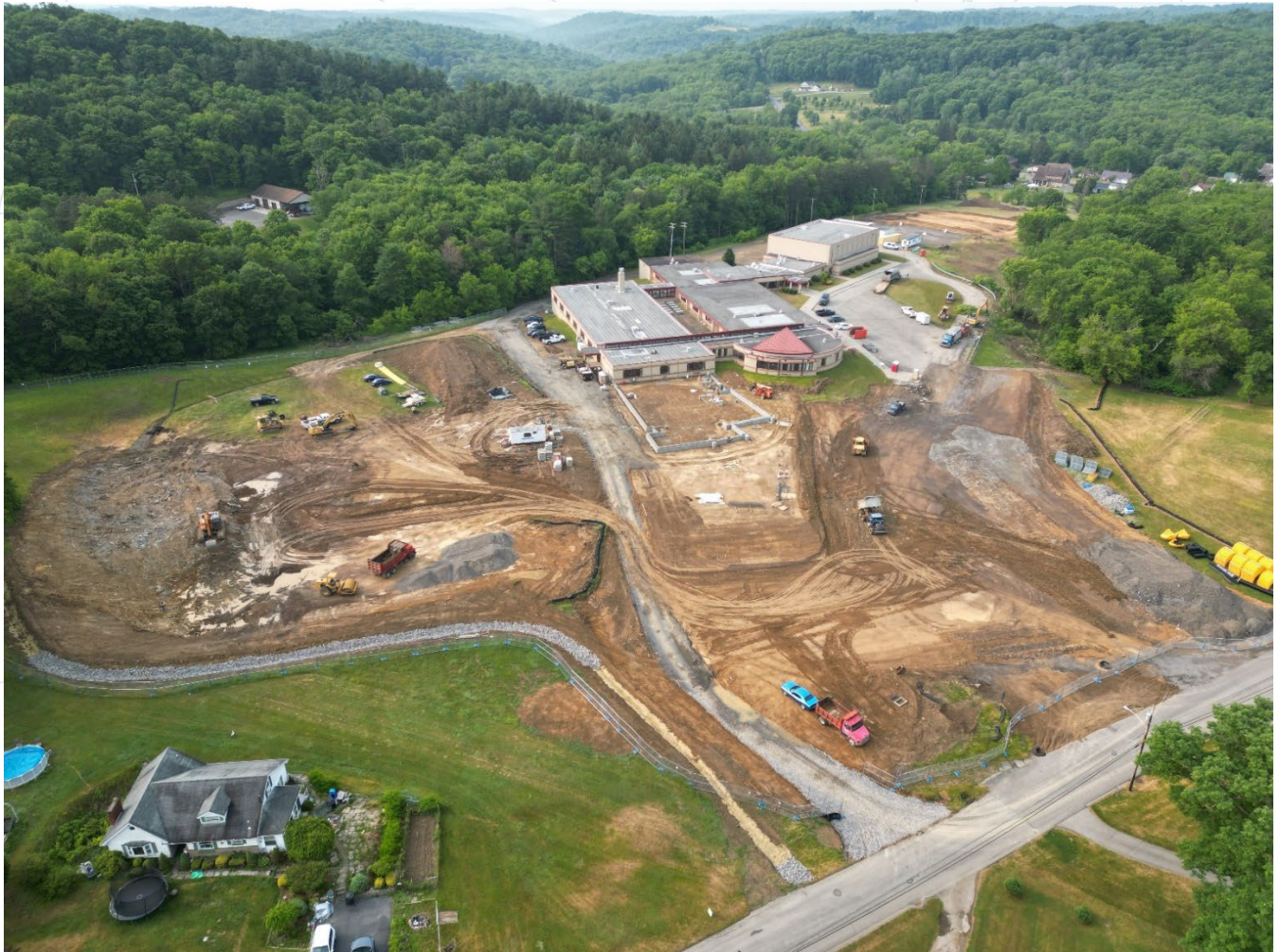
Aerial – June 15, 2023