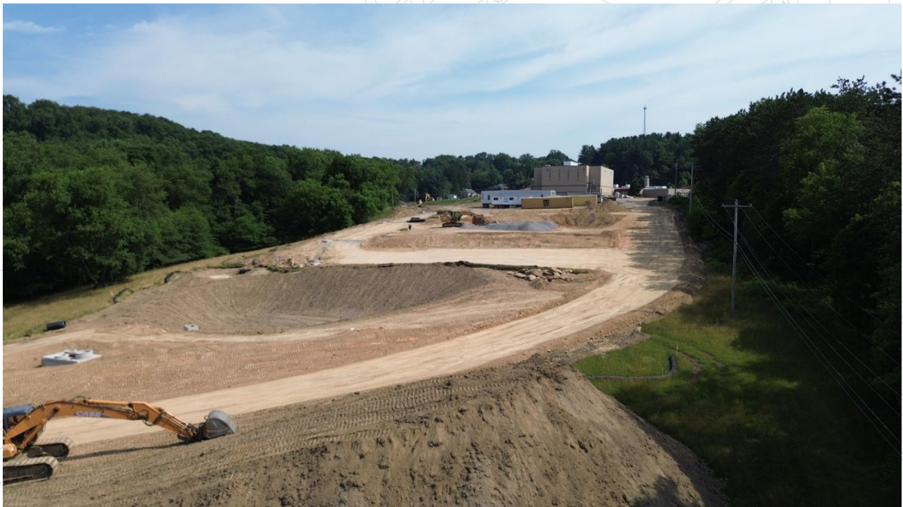
Aerial Photos – July 15, 2023