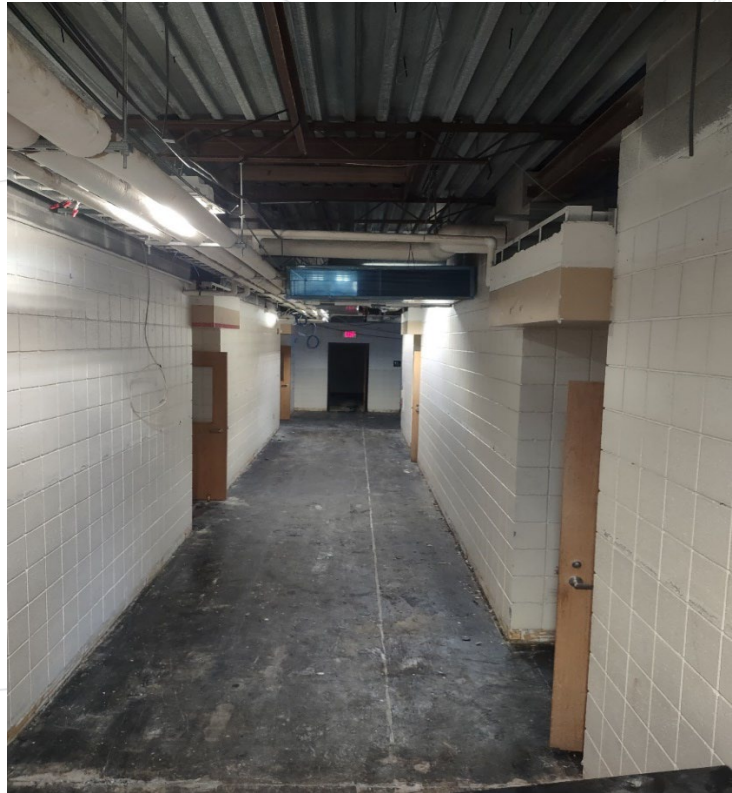
Interior Corridor Renovations