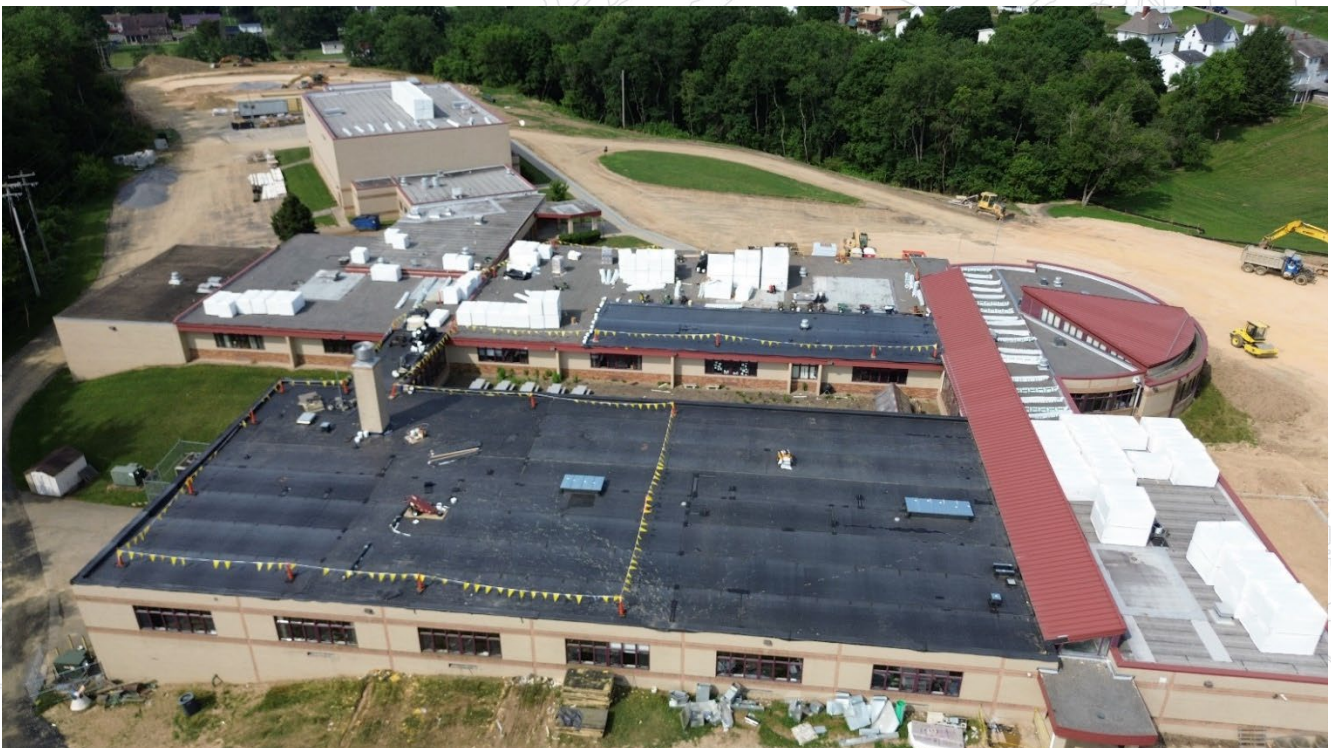
Roofing Progress – July 15, 2023