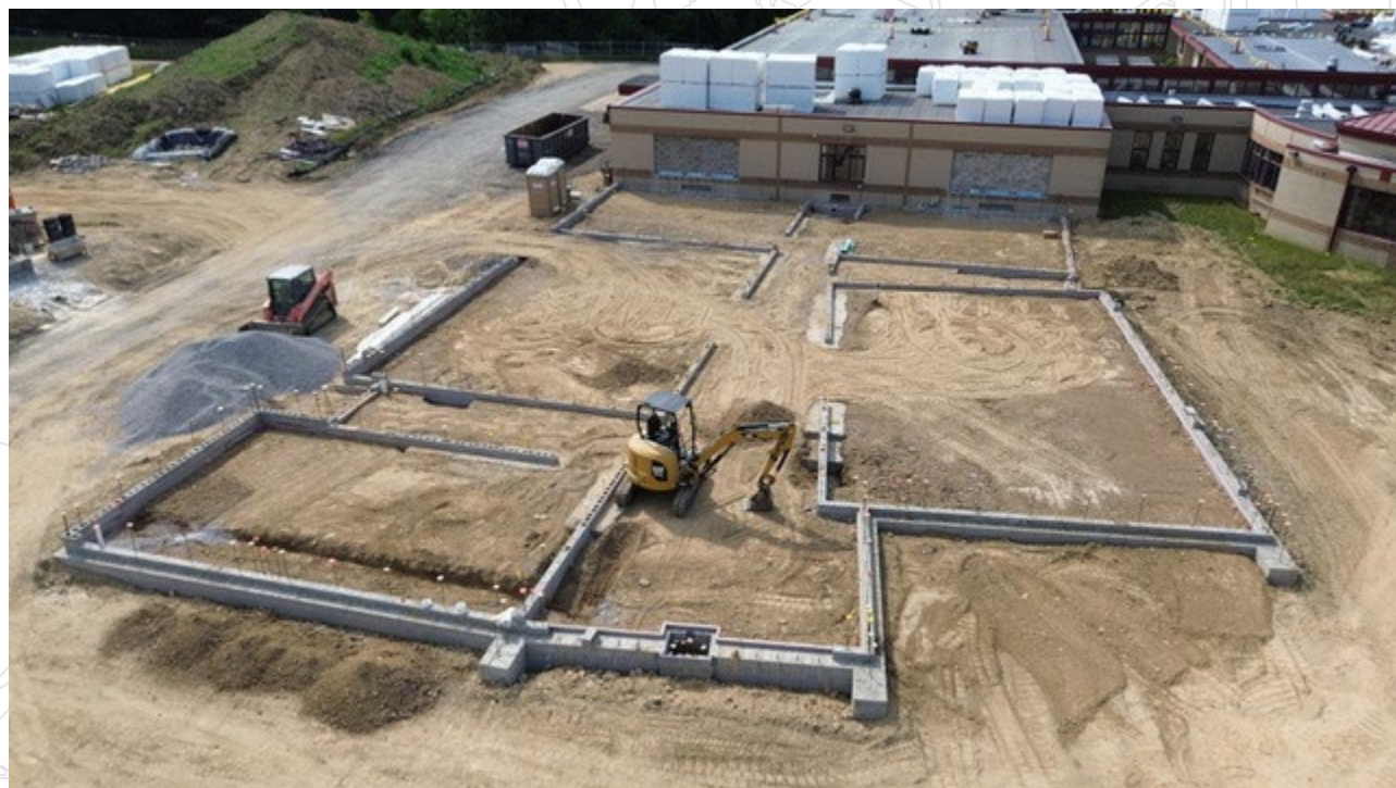
Aerial Photos – July 15, 2023