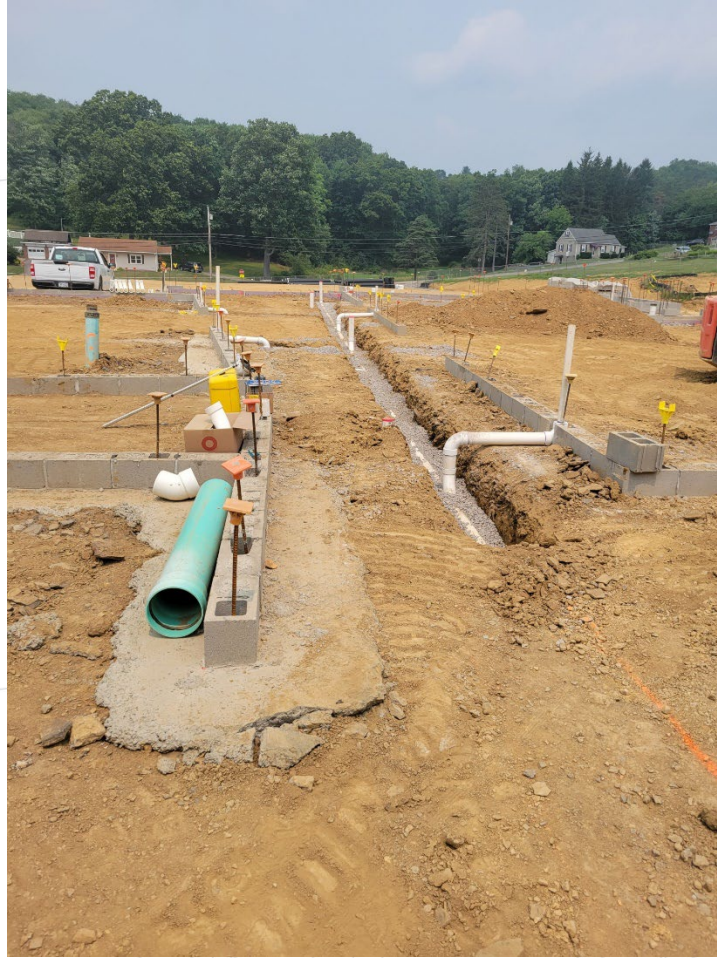
Classroom Addition Underground Rough-Ins