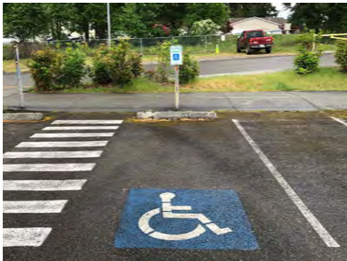
Note that the right ADA stall at the east end of the parking lot looks very wide due to there being excess room.