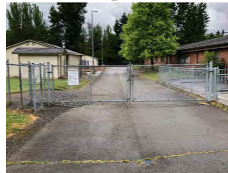
For field access, continue to the north western part of the parking lot. Continue straight through the vehicle gate, and follow the pathway, on your left, out to the fields. Note that this gate is locked at most times. A key may be obtained from Security.