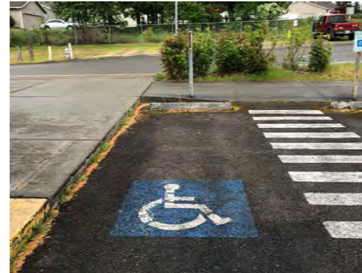
The other ADA stalls, at the east end of the parking lot, are both car stalls. The curb cut does not meet all ADA standards.