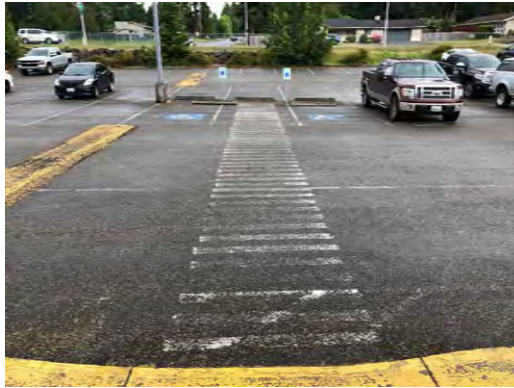
From main ADA stalls in parking lot, use the crosswalk and curb cut to gain access to the sidewalk. Note that the curb cut does not meet all ADA standards. For building access, use the nearest door, at the southwest corner of the school.