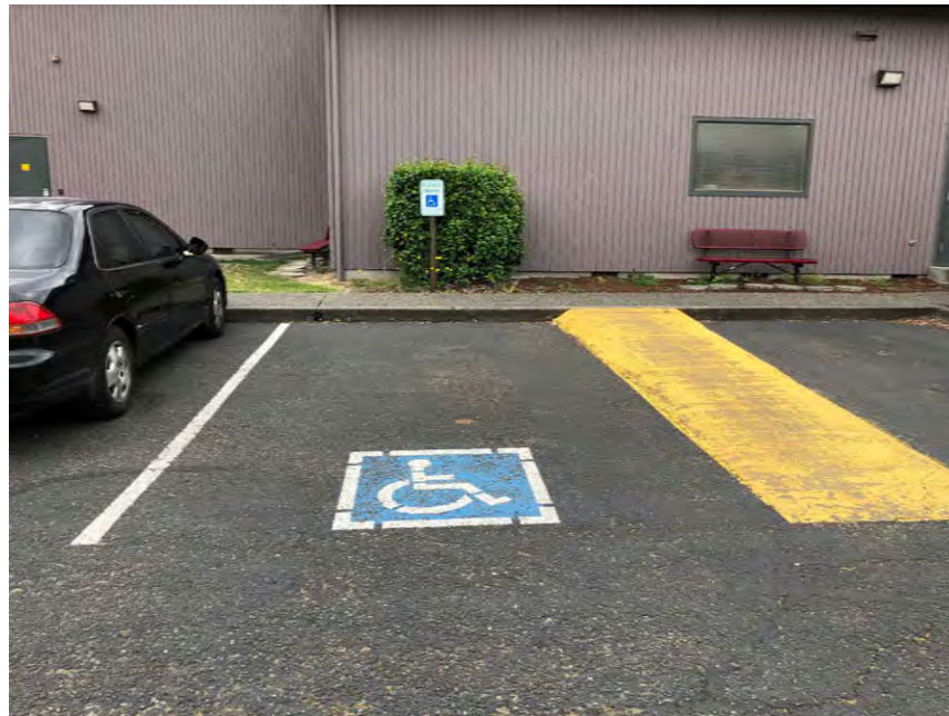
ADA parking stall by main building. Note that the ramp does not meet ADA standards. Also the stall is not labeled as "Van Accessible," but it is wide enough. For building and/or field access, the ramp can be used to gain access to the sidewalk.

ADA Site Photos E.B Walker High School 5715 Milwaukie Ave. E. Puyallup, WA 98372