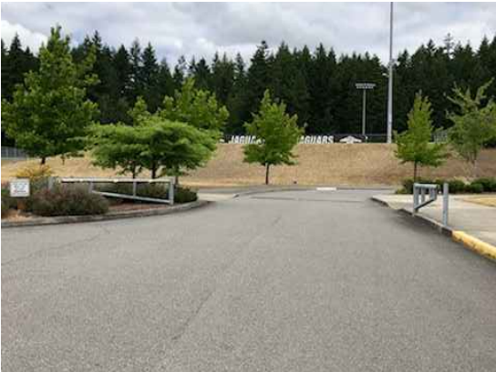
Once on the sidewalk on west side of school, head North for field access. Continue past the vehicle gate and use the curb cut to cross the street. Follow this pathway to whichever field you need.