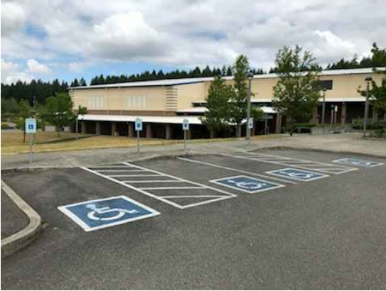
ADA stalls in parking lot. For field/building access, follow the sidewalk in front of the stalls.