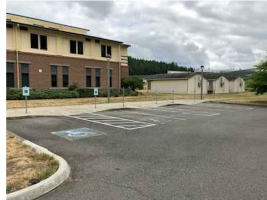
More ADA stalls on east side of parking lot.