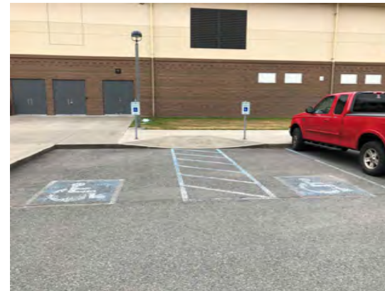
More ADA stalls in the back of the school for easier field access.