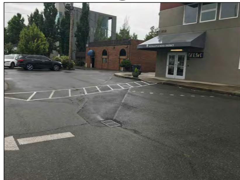
Continue along the crosswalk and up the curb cut. Note that the curb cut does not meet all ADA standards. Use the nearest doors for building access.