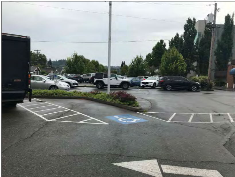
For building access, use the ADA stall in the center of the parking lot.