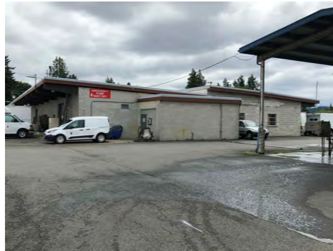
Continue heading east, past the Transportation building and bus garage. Through the bus parking area, at the other (eastern- most) end of the site, lies the Maintenance building. Enter through the nearest door, located at the northwest corner of the building.

ADA Site Photos PSD Maintenance/Central Laundry 324 9th St. N.W. Puyallup, WA 98371