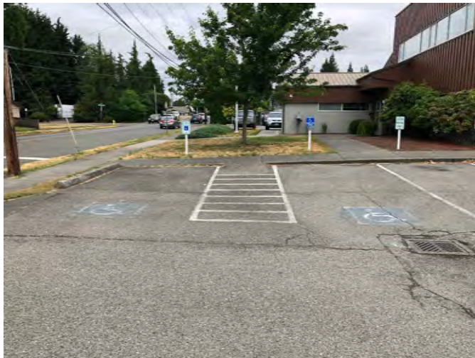
From ADA stalls in the parking lot, continue up the asphalt ramp and follow the sidewalk on the south side of the building for access. Note that the asphalt ramp from the parking lot does not meet all ADA standards.