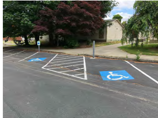
For building access from these ADA stalls follow the sidewalk north until you reach the pool.