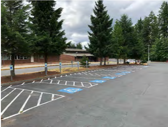
Main group of ADA stalls.