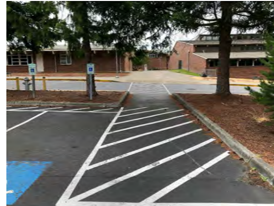
From the main group of ADA stalls in the parking lot, continue over the crosswalk, and follow the sidewalk south, using the first doors to gain access to the pool building.