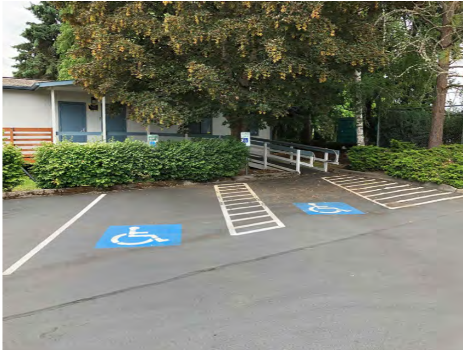
From ADA stalls by the STARS facility, continue up the ramp to the STARS building, the first door on the right. For access to the Summit Facility, continue along the same ramp, which leads to the other portable, and use that door.

ADA Site Photos STARS Center 615 7th Ave. SW Puyallup, WA 98371