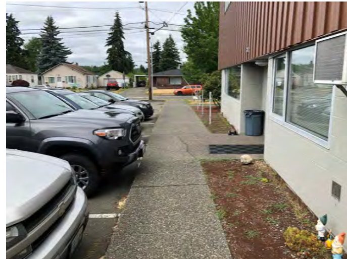
Use the doors on the south side of the building for access to the Transportation building. You can also reach Transportation from the doors on the west side of the building. Note that Transportation is only the first floor of the building.

ADA Site Photos Transportation Support 323 12th St. N.W. Puyallup, WA 98371