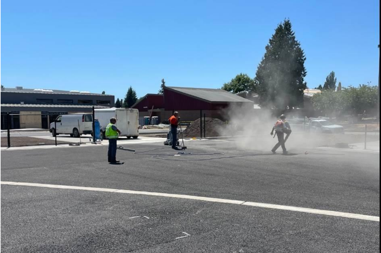
Prep work for the rubberized track surface