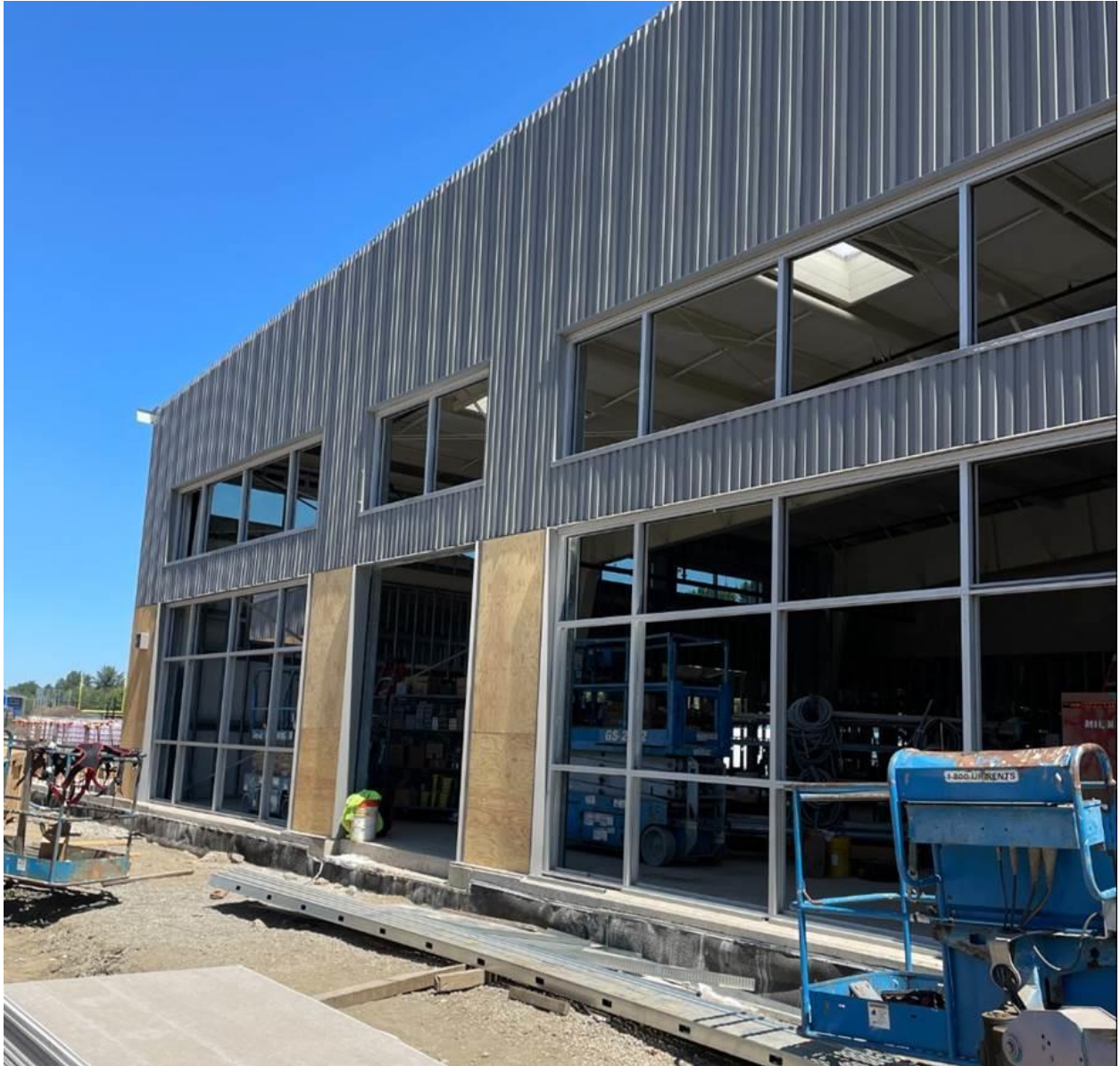
The outside of the new CTE Wing will be complete once masonry is installed