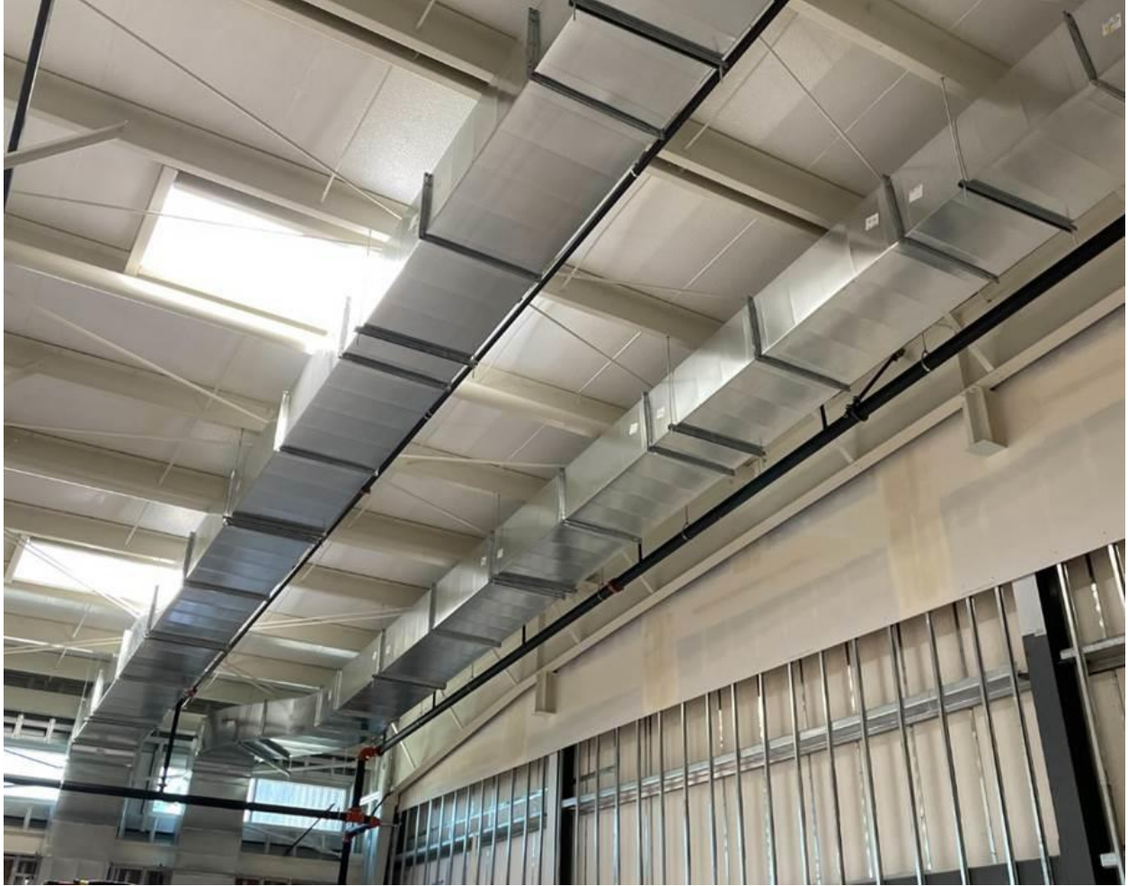
Ductwork installation in the new CTE Wing