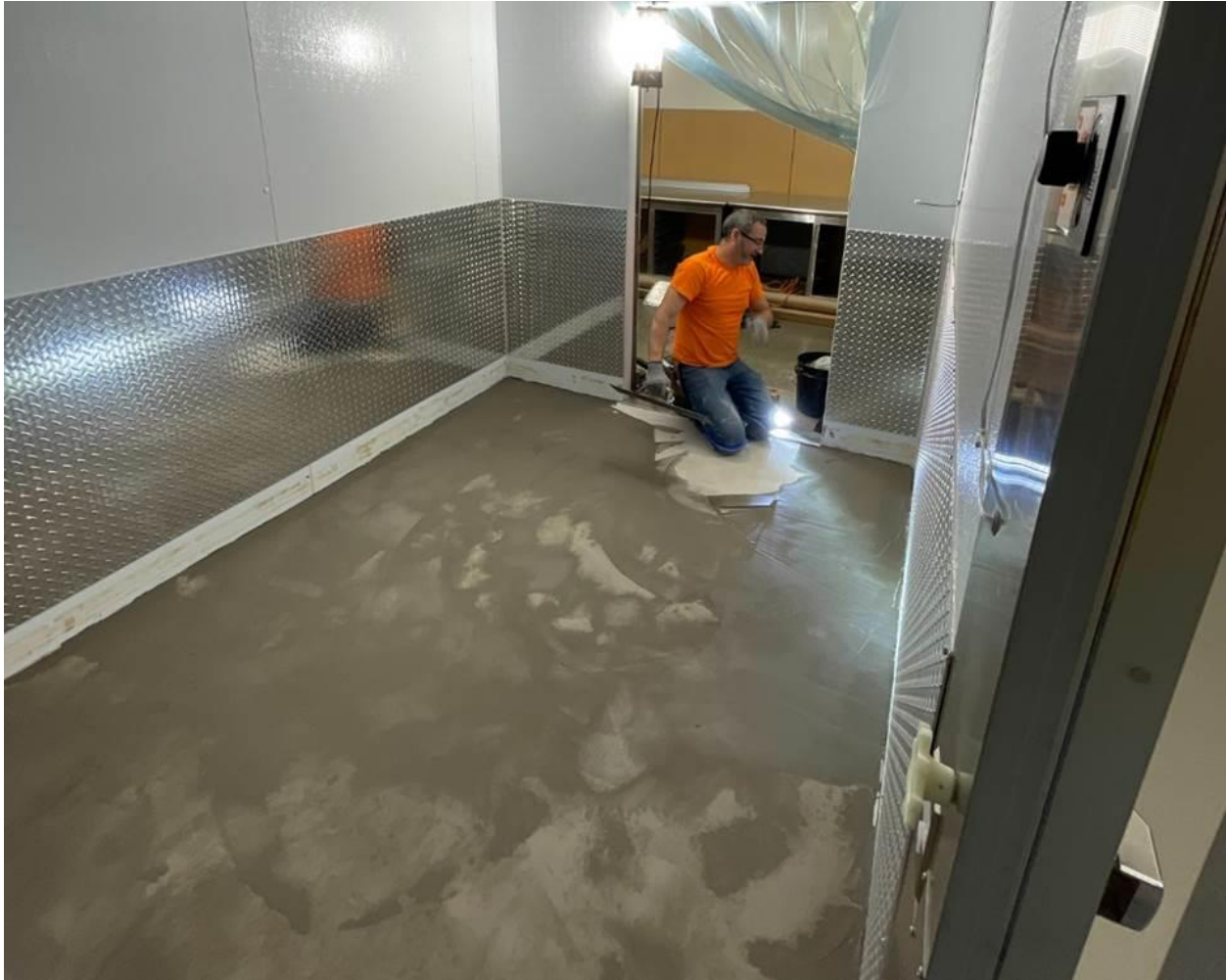
Final flooring installation in the main kitchen's coolers