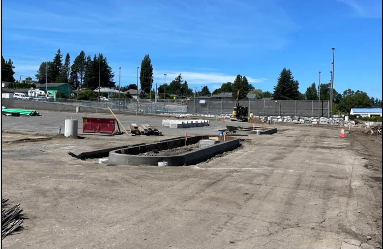
Parking lot pre-asphalt preparation work continues