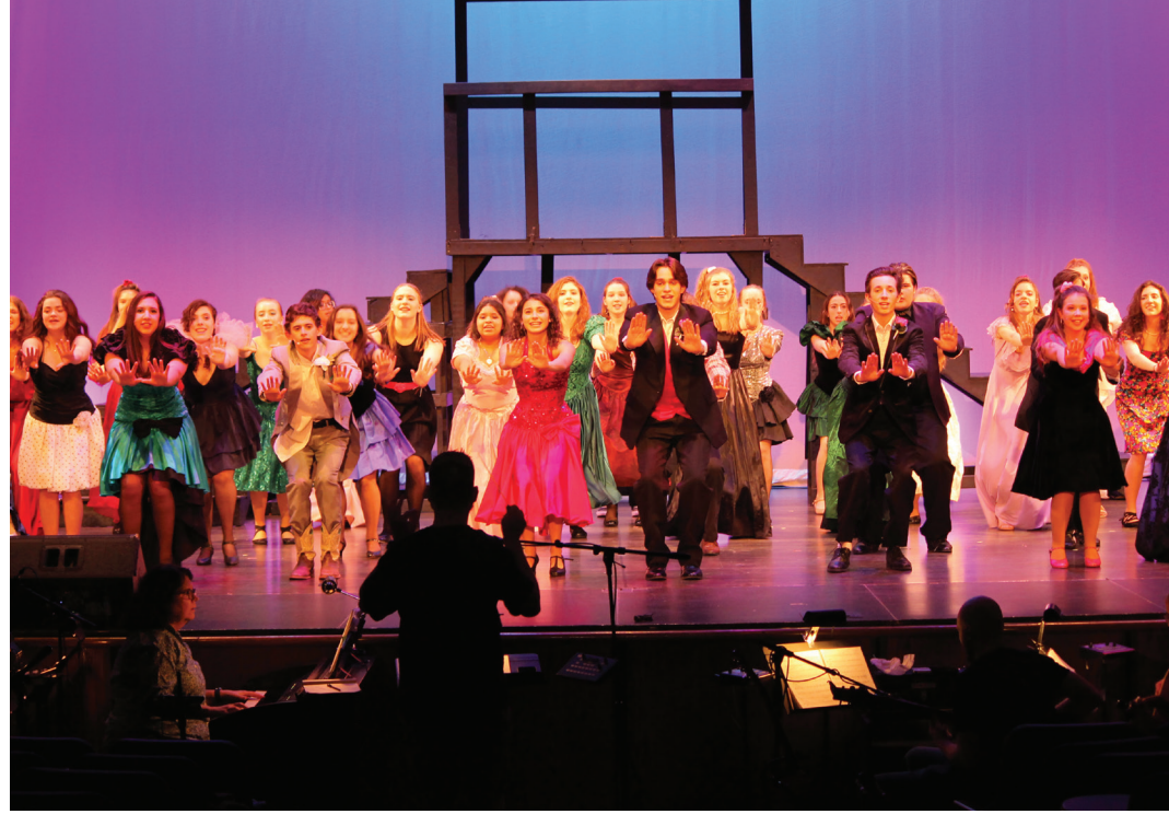
The cast of Footloose, this year's spring musical.