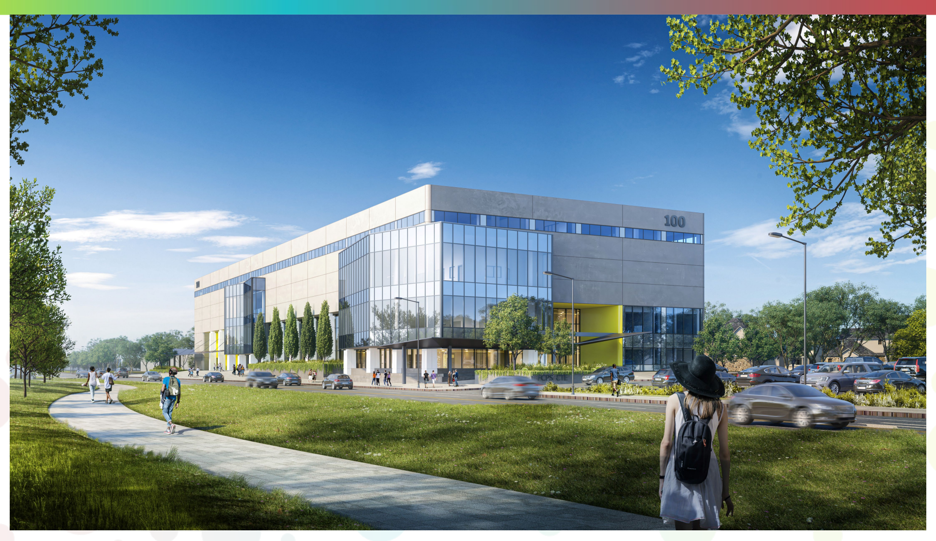
Week Ending June 30, 2023