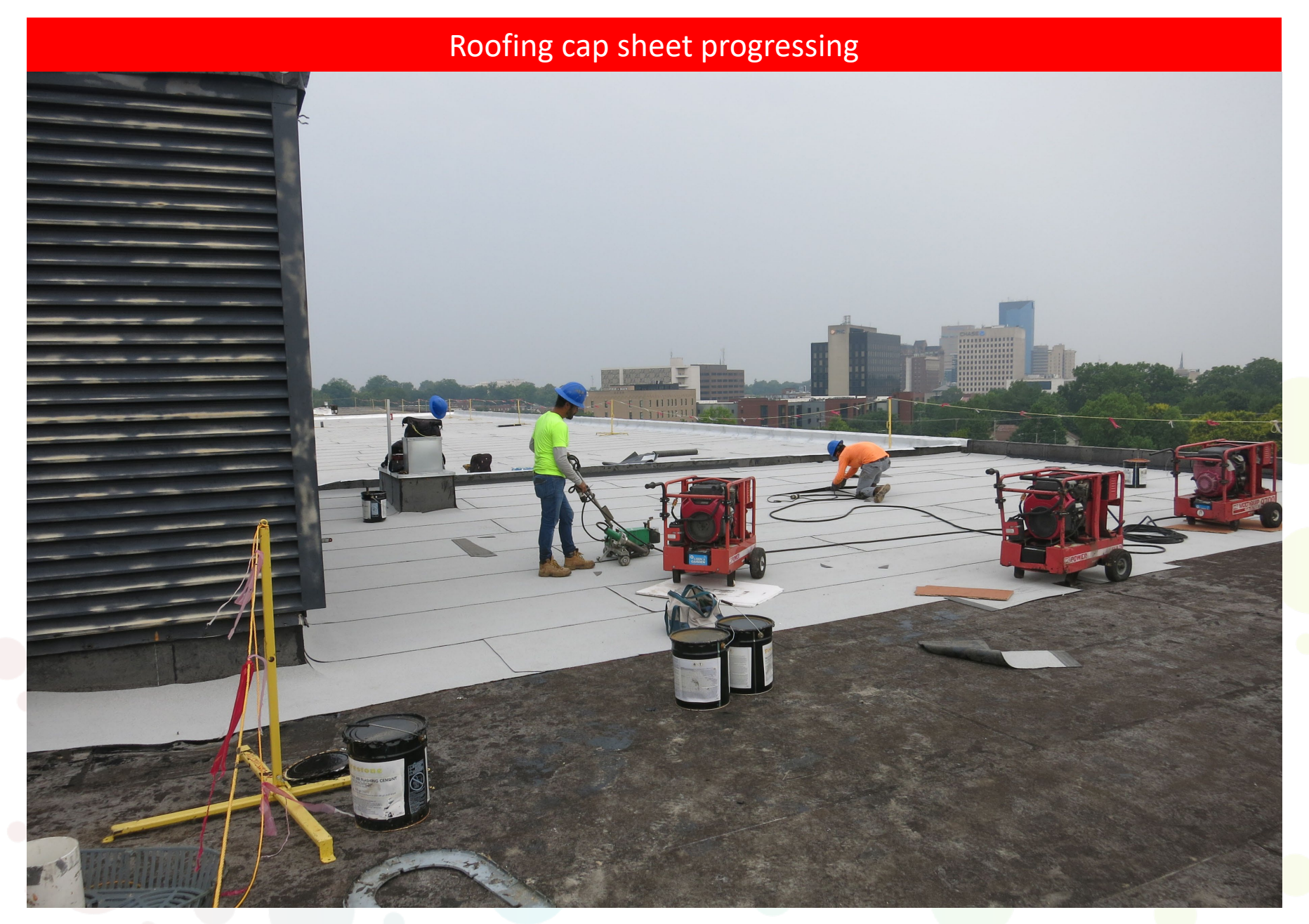
Week Ending June 30, 2023