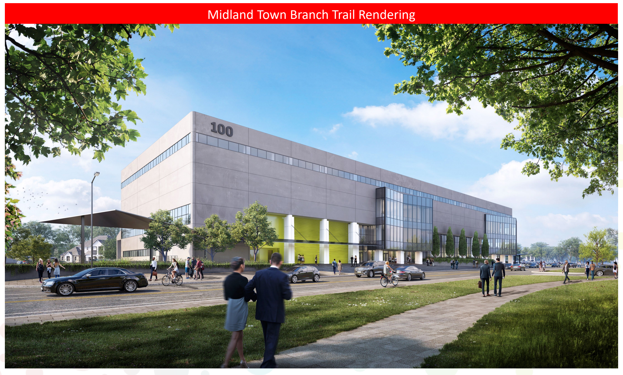
Week Ending June 30, 2023