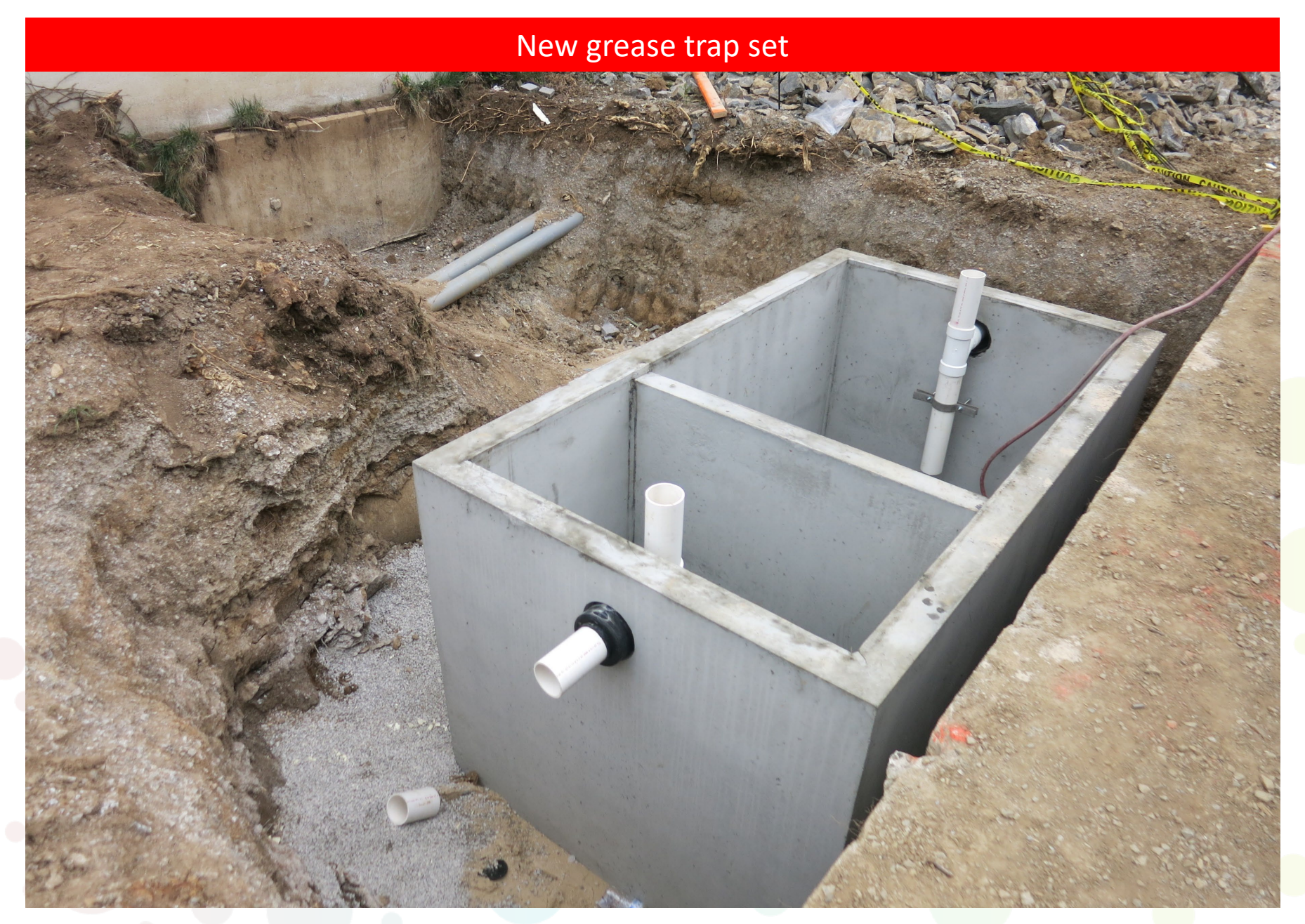
Week Ending June 30, 2023