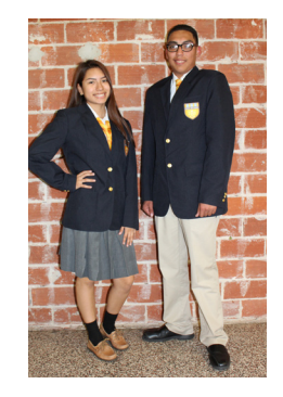
Level 1 Dress Code (Seniors)

Excerpts from Student Handbook. Refer to Student Handbook for full guidelines.