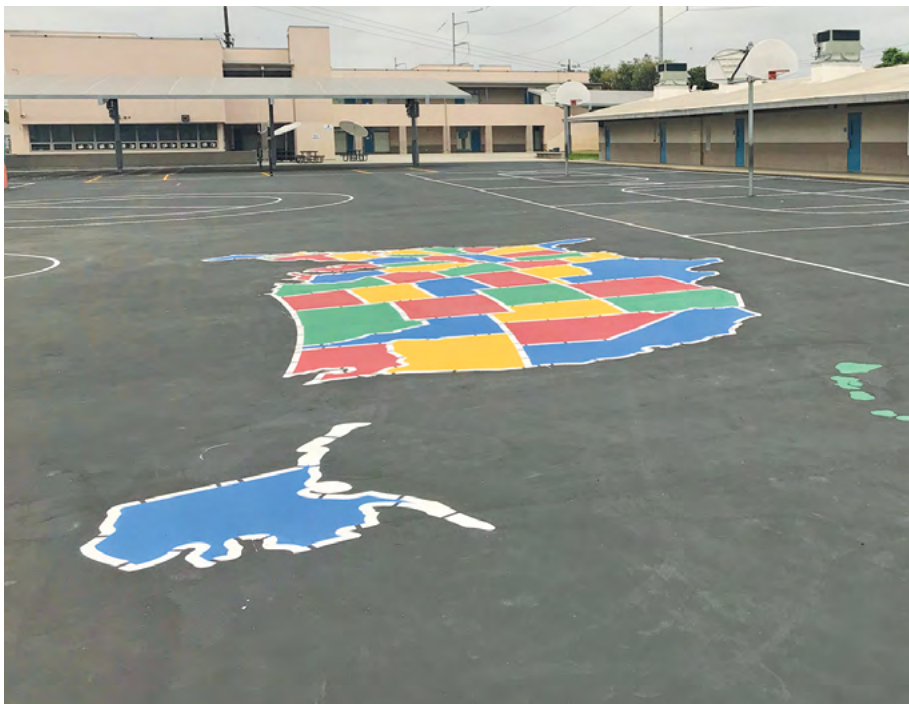
West Blacktop was repainted and re-striped including tether ball, handball, volleyball, basketball courts and emergency evacuation dots, and our map of the United States!

addition to passing out thousands of meals, we've been fortunate enough to have several improvements to our facilities. Air conditioning units were upgraded and replaced and our playground on both sides of campus was repaired, repainted and re-lined. In addition to that, we have plans to replace all carpet and floors in every room this winter! Although we're still not sure exactly when we can return to campus, I promise you that when the time comes, our school will be clean, cool and ready to welcome you back!