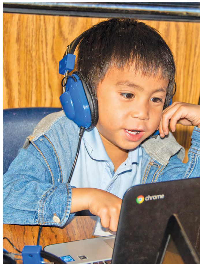
Students continue their learning on-line as the 2020-2021 school year begins. Los estudiantes continúan su aprendizaje en línea a medida que comienza el año escolar 2020-2021.