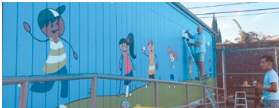
New murals that enhance our campus

Two new murals have just recently been added to York School on the kindergarten side of campus. These colorful murals were placed in a newly created play area for our kindergarten students to enjoy. Like the mural slogan states, "A fun place to play and learn"! Specifically designed by Operation Clean Slate showing an assortment of young children playing and laughing. The murals enhance a once empty area where a portable classroom sat for years and was removed some time ago leaving a gap between two bungalows. Now the kindergarten students have another small, cute and safe place to play!