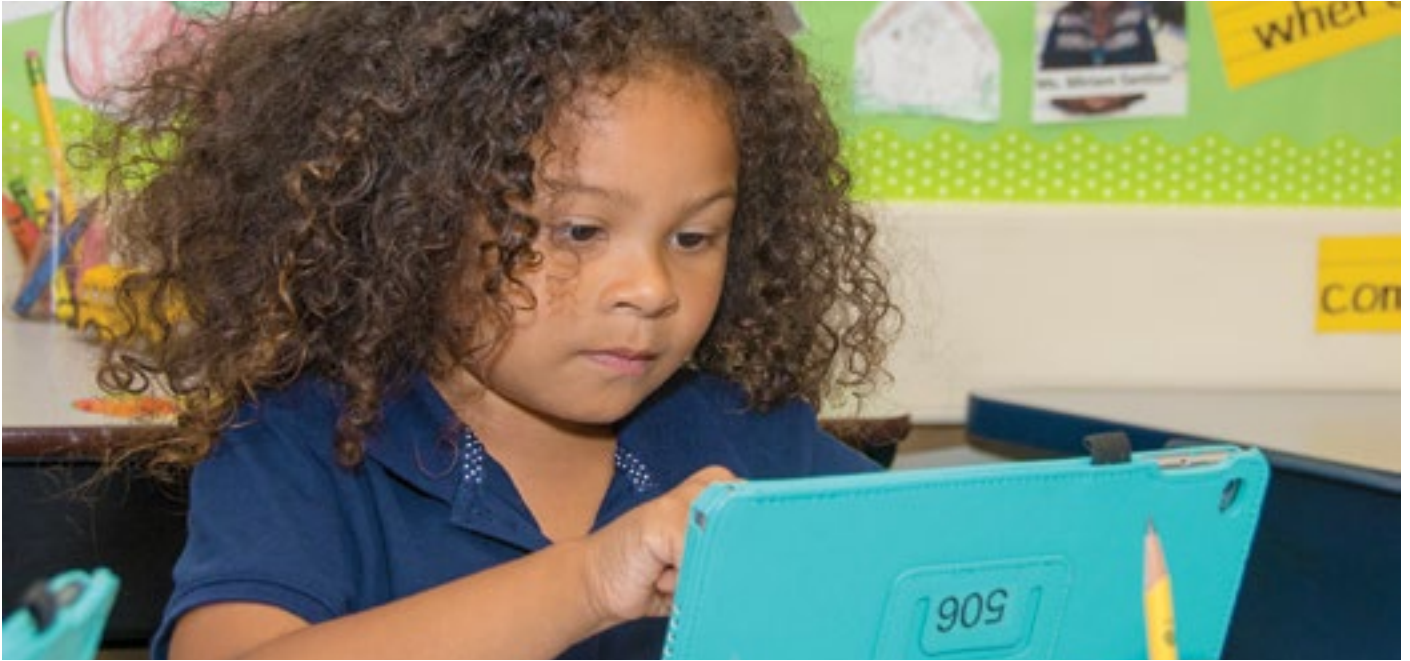
Early Literacy for all Hawthorne Children Alfabetización Temprana para todos los niños de Hawthorne