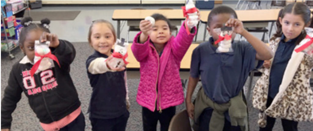
Donuts with the Dean - Fun Crafts

If you are interested in helping at any of our activities, please contact the front office. York Super Star students love getting vouchers!