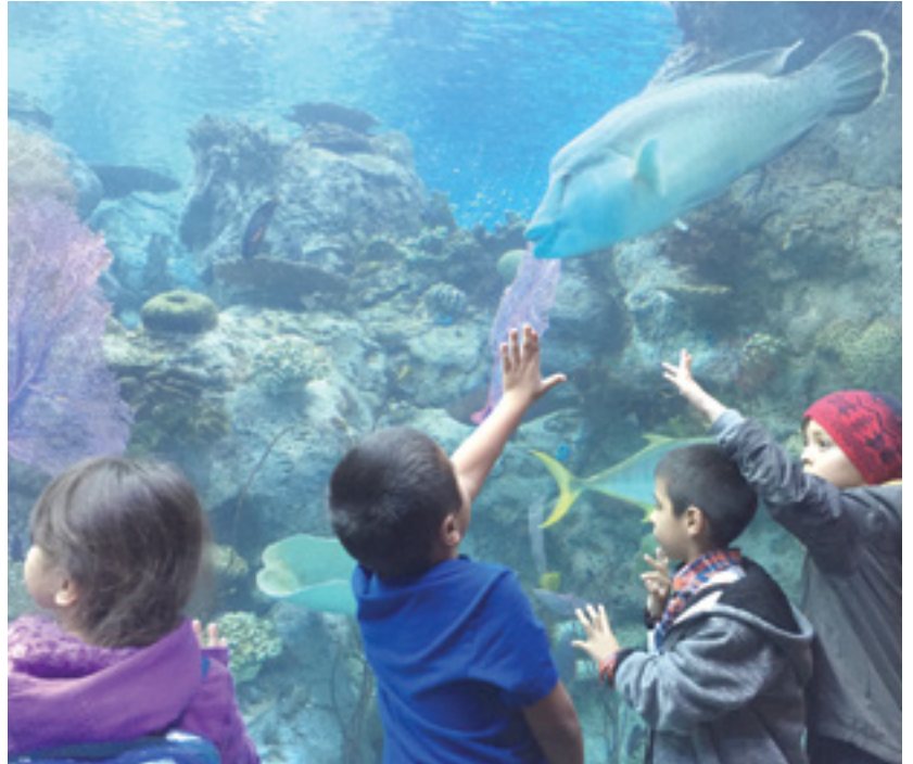
Kindergarten students experience under the sea wonders of the Aquarium of the Pacific

Our additional study trips for the various grade levels include a zoo, a science center, a museum dedicated to popular American music and its award winners, a space center and an observatory. Our fifth-graders are also invited on a walking tour of Prairie Vista Middle School where they will be able to find out more about the excellent classes and unique programs offered for them in the 2017-18 school year.