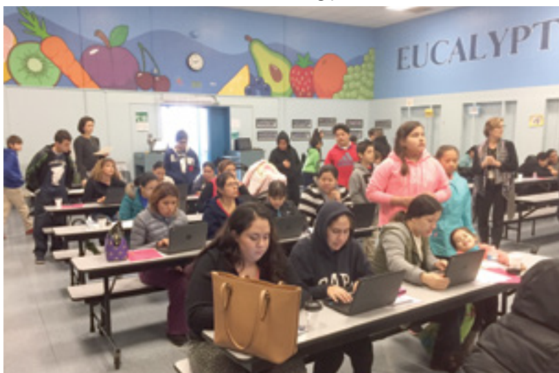
Eucalyptus students assist parents at our technology workshop in February.

We look forward to seeing you at the next event!