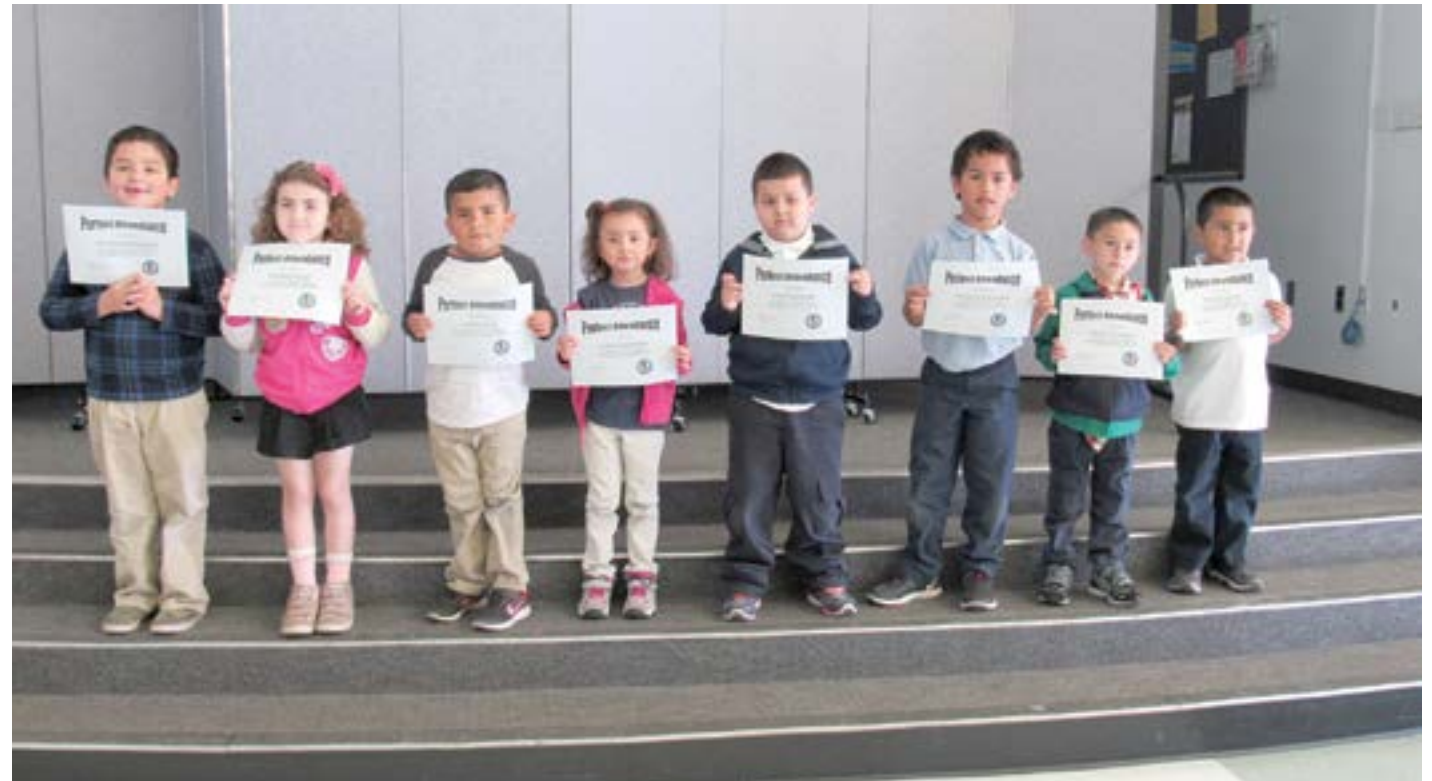
Jefferson kindergarten students proudly display their trimester Perfect Attendance Award.

Jefferson emphasizes good attendance from TK through fifth grade. Let's strive to reach our goals of getting students to school on time daily and do our best to plan appointments after school hours. Good attendance is a priority for our wonderful students, and we appreciate the efforts of our parents who contribute to these goals.