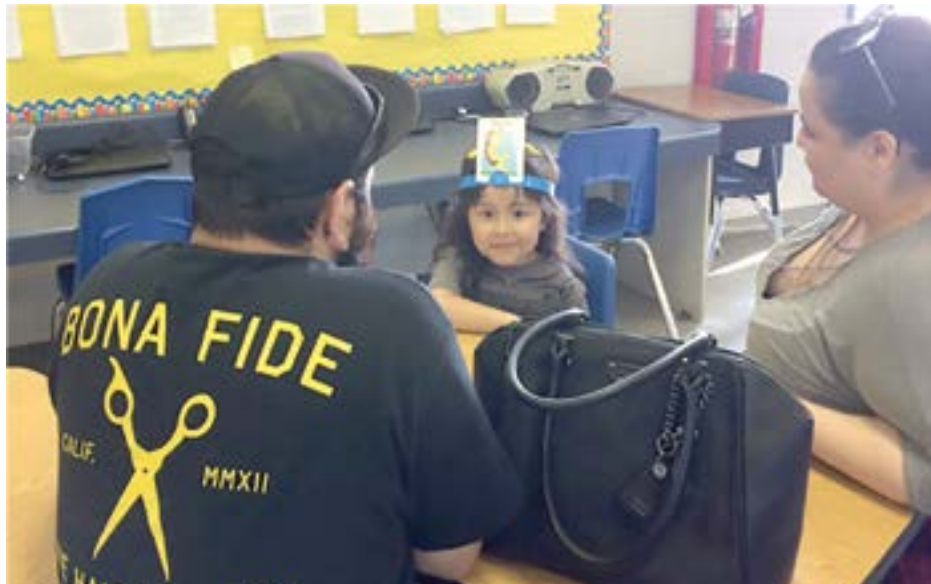
Families learning about adjectives with each other playing "Head Bands."

throughout the campus. As families exited the campus, they had the opportunity to enter a raffle. Winners were announced the following morning to collect either board games or books.