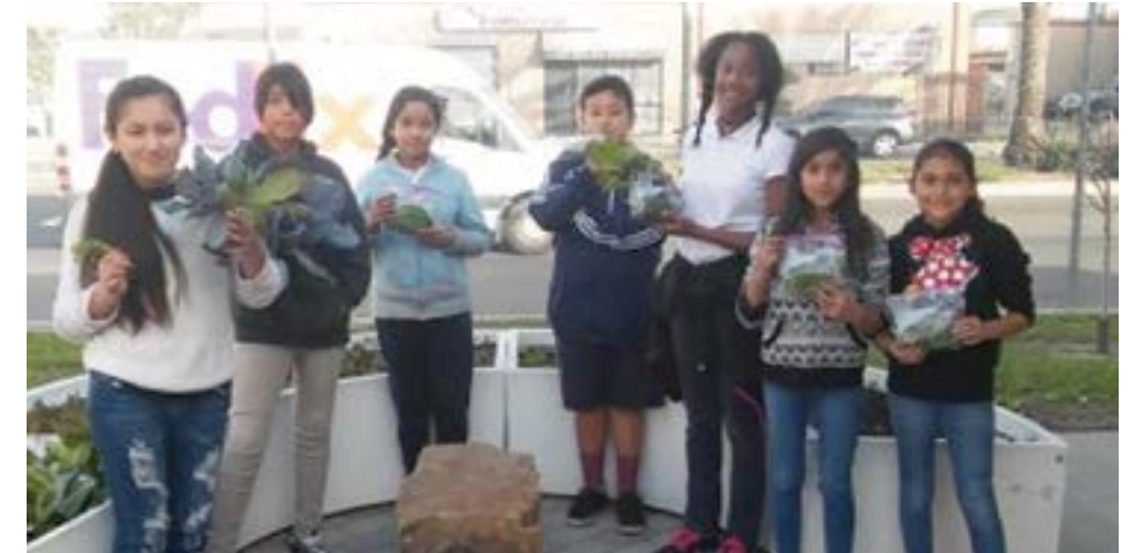
Students working in the Gardens at York School.

We couldn't be prouder of our students and teachers!