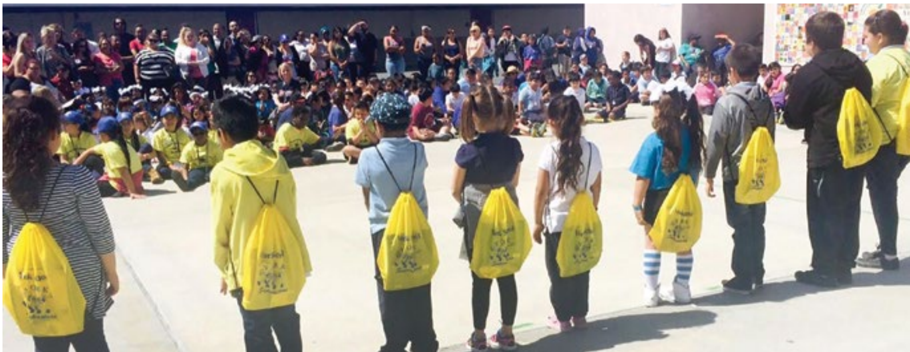
York Super Stars at the Spirit Assembly!

The entire staff, student body and parents all work together to make York a calm and nurturing school environment. We are so happy for our students, staff, and community. We are Super Stars!