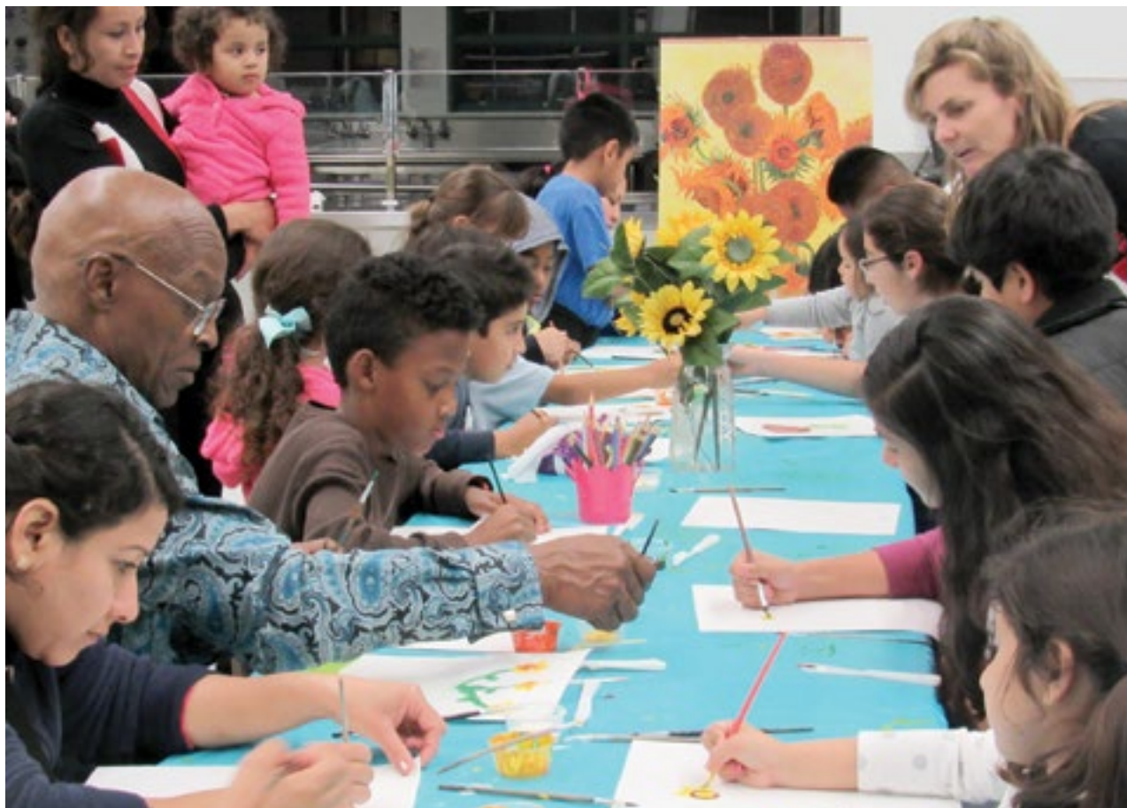
Jefferson families create their interpretations of Vincent Van Gogh's Sunflowers.

This fun and interactive workshop allowed students and their families to use their creativity and imagination to produce beautiful works of art. A memorable and educational night was had by all!