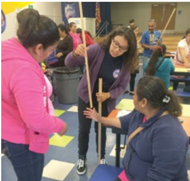
STEM Parent Workshop.

Our parents loved the lesson and had a great time!