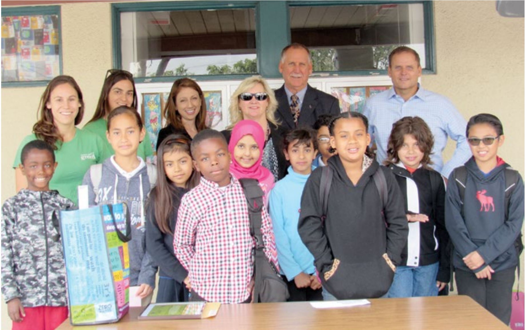
"Greenest Cafeteria" is awarded to Jefferson School by Grades of Green.

We are lucky to have such a great team to implement this program with great success.