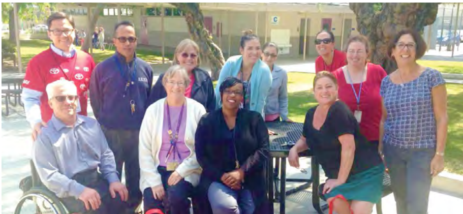
A Few of York's Outstanding Staff.