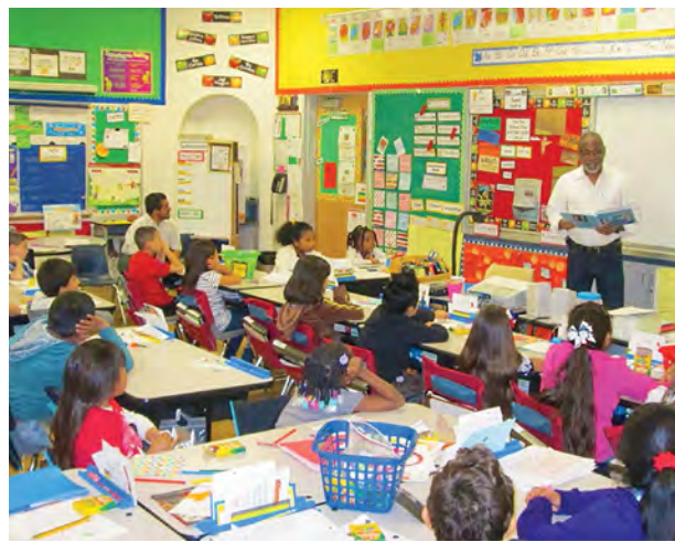
Volunteer Reader sharing his love for literacy with our Wildcats.

Washington continued the celebration with a week of fun activities, a Seuss-inspired photo booth for pictures, and incentives to promote reading. At recess and lunch, students gathered around benches to hear stories read by Washington staff members. The students loved hearing new stories! Each day, excitement grew as students anticipated what new stories they would hear.