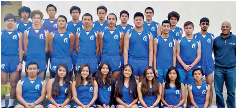
Cross Country - 2014 League Champions.

The two strongest sports at HMSA are cross-country and girls' softball. Cross-country has made the playoffs the last three years and won the Coastal League twice. Girls' softball placed second in the league last season and is currently on a nine-game win streak.