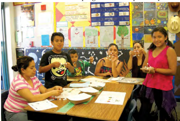
Math is fun! A Jefferson family creates polyhedrons out of marshmallows and toothpicks.

The fourth-grade parents experienced a Common Core activity which identified and named simple geometric shapes. They then used those shapes to