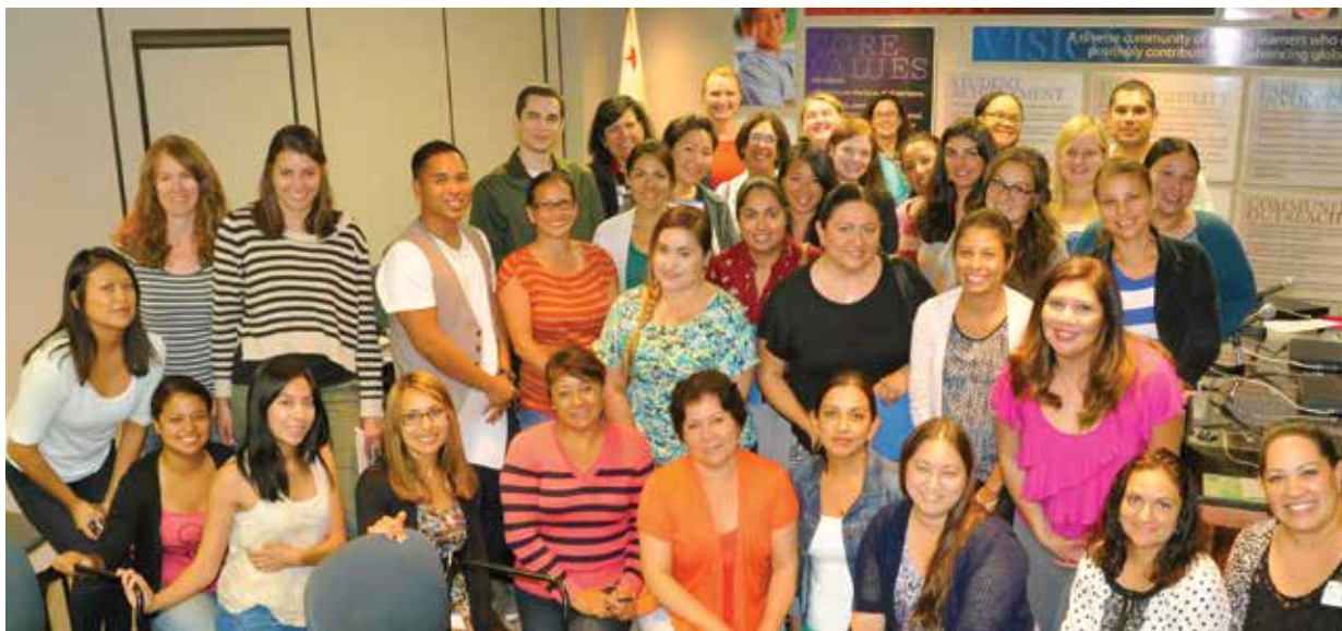
New Teacher Training