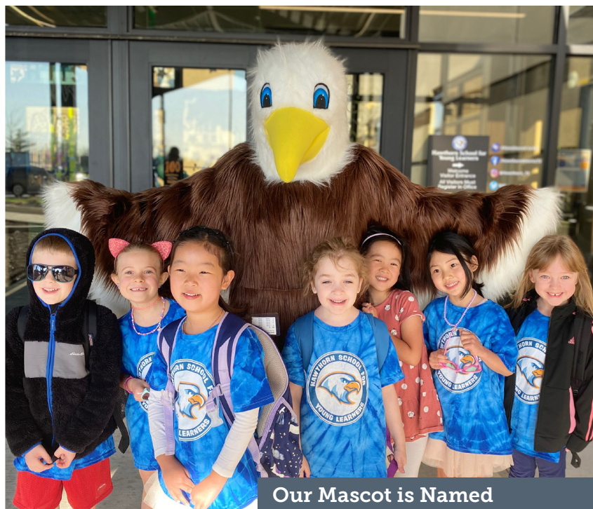
Our Mascot is Named