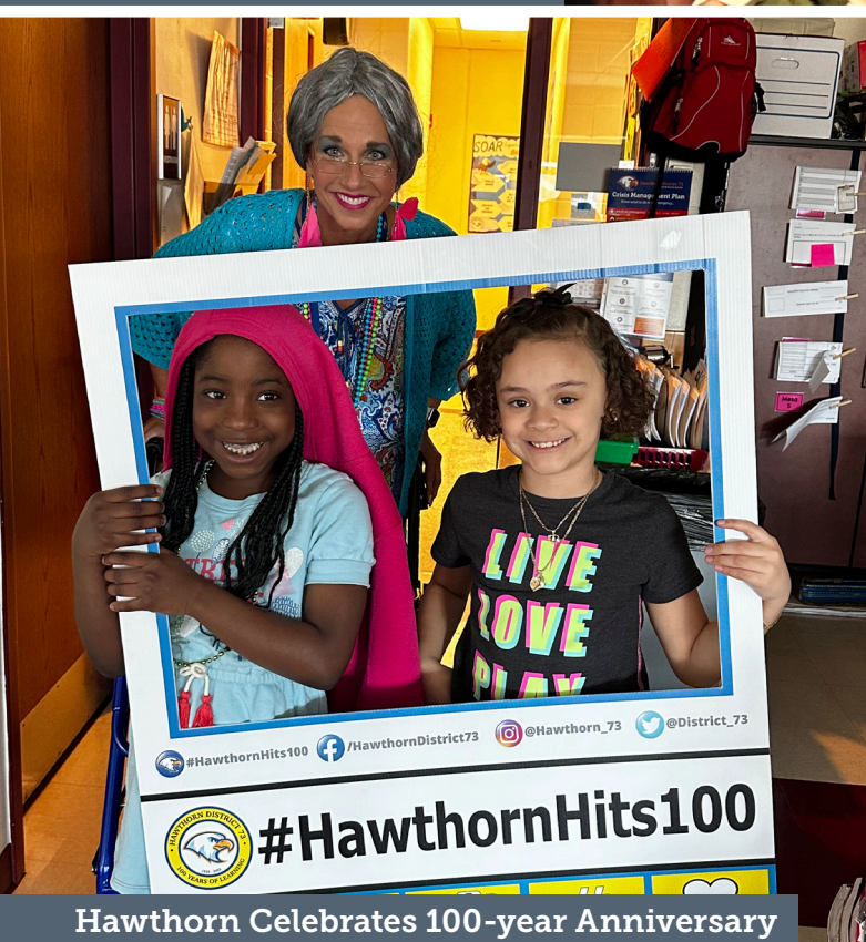
Hawthorn Celebrates 100-year Anniversary