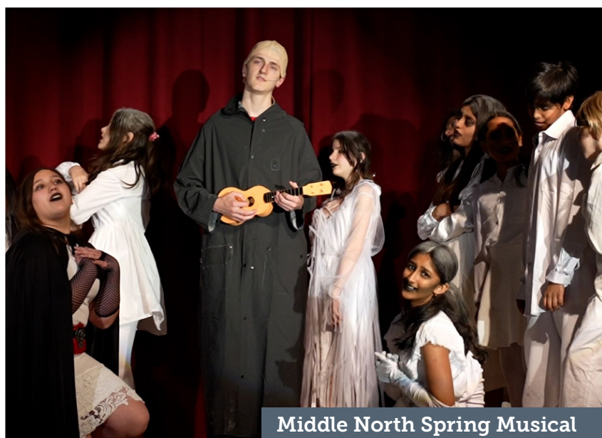
Middle North Spring Musical