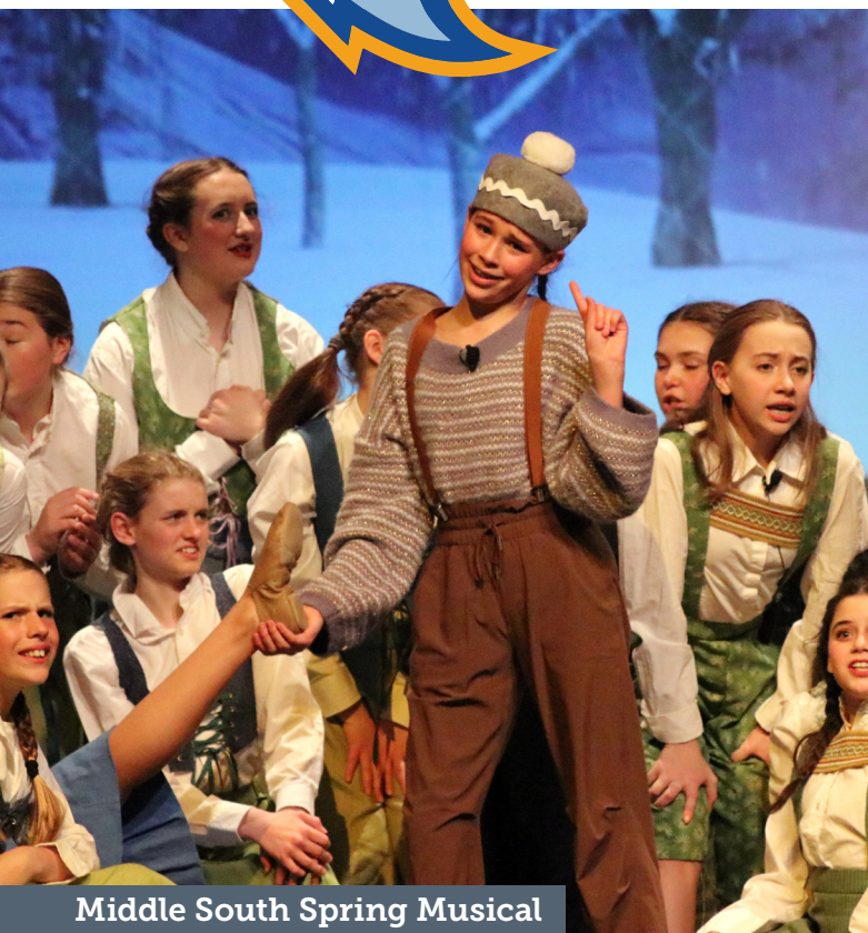
Middle South Spring Musical

DISTRICT 73 COMMUNITY UPDATE | JUNE 2023