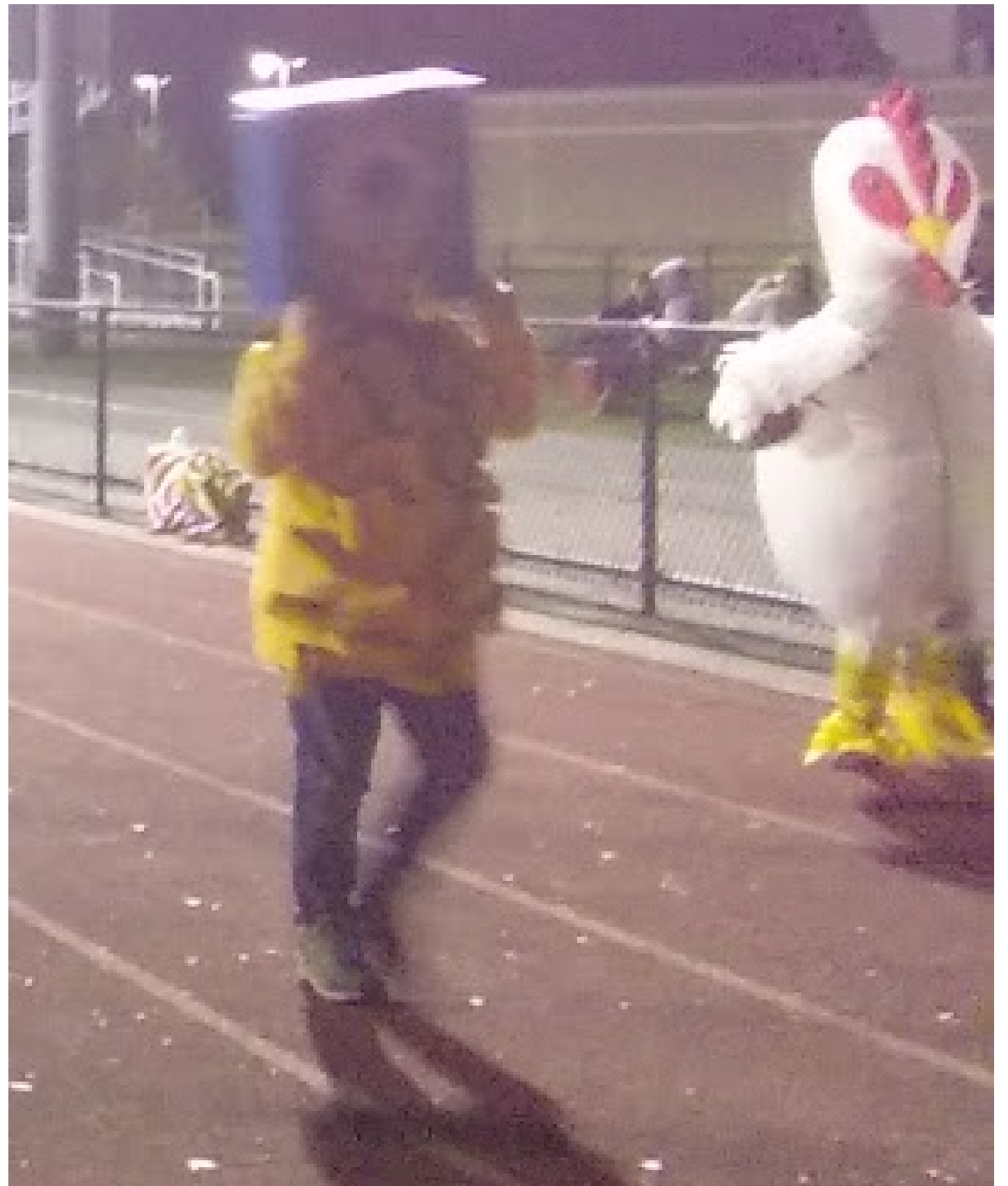
Mac and Cheese and inflatable chicken