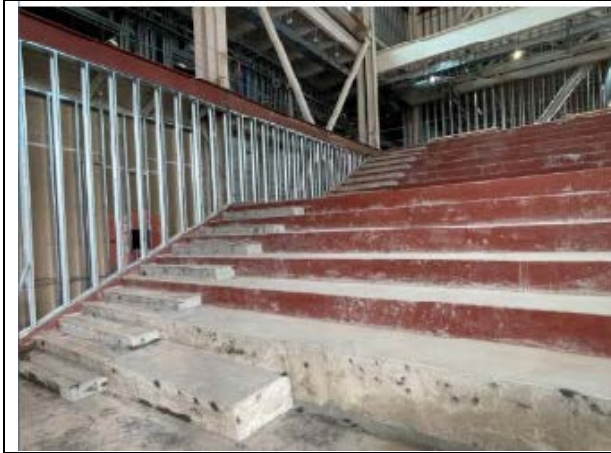
Learning Stair Concrete