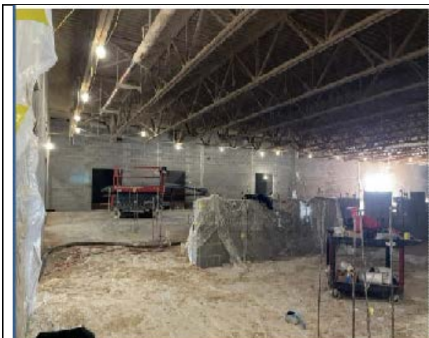
Area K Fireproofing