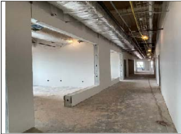
Area C Drywall Priming