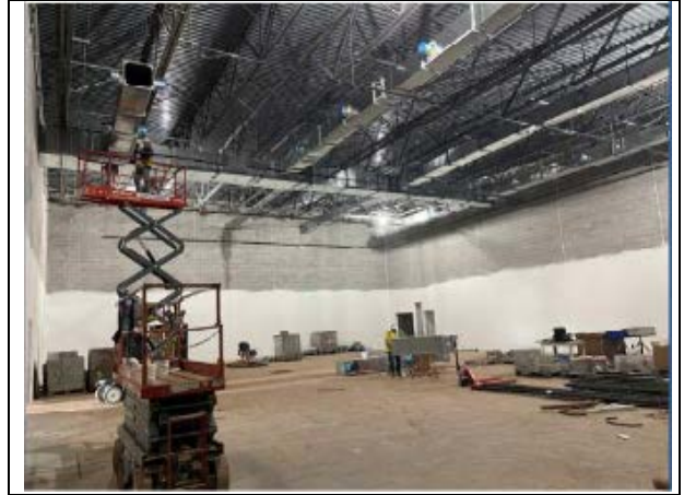
Block Filling and OH MEP Area F