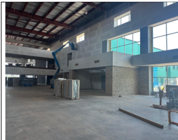
Bistro and Bridge Area E