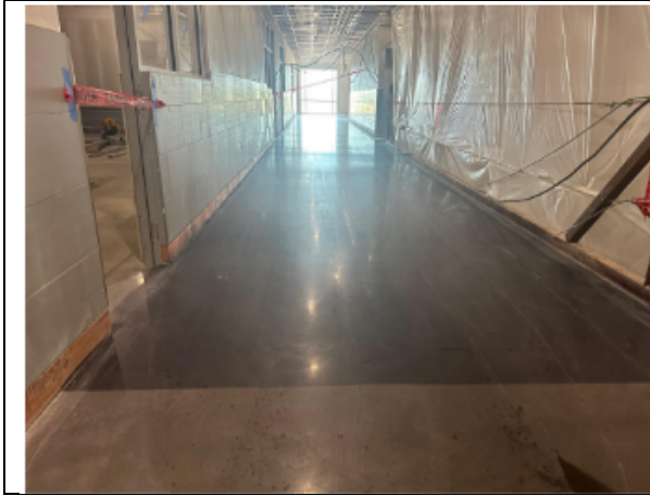
Area P Floor Polishing