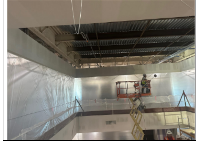
Area A Commons Overhead