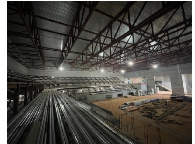
Competition Gym Upper Level Framing