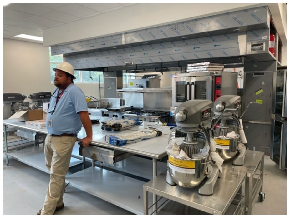
Culinary Studies Kitchen