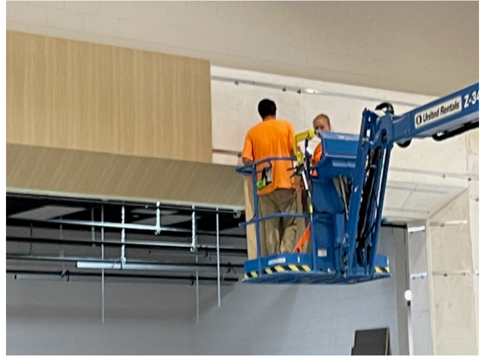
Trim being installed over Stage area in Caffeterium