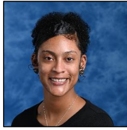
ASC Staff, EYP Saphyre Hunt