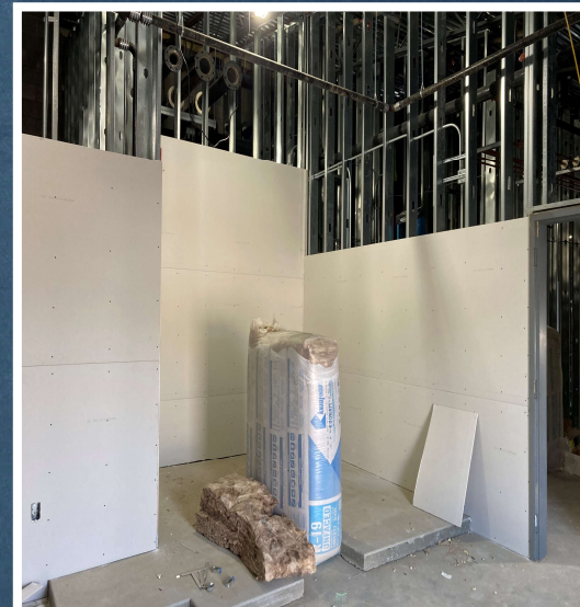
Hanging GWB Building A Mechanical