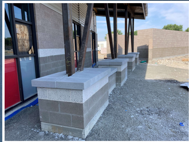
Pre-Cast Caps Installed