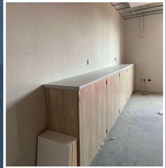
1 st Floor Countertops Installed 1 & 2