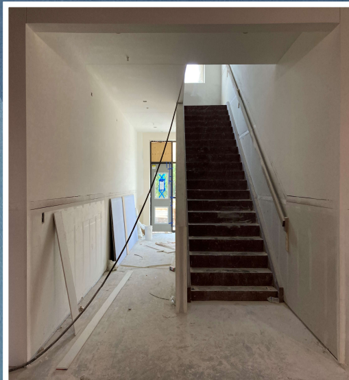
Building B Mid Stairwell Finishes