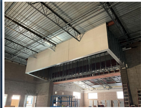
Hanging GWB at Multipurpose Stage