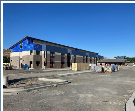
NE Exterior Overall Progress