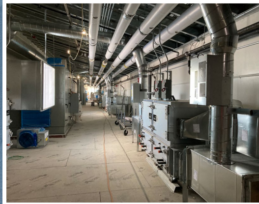
3 rd Mezz Overall Progress