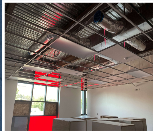
1 st Floor Classroom Grid & Light Fixtures