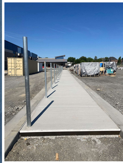
North Lot Sidewalk