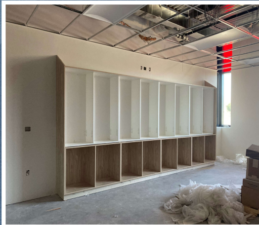
1 st Floor Casework Ongoing