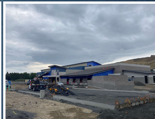
Overall Exterior Progress