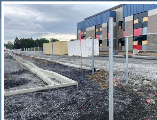
Installing Fence Posts