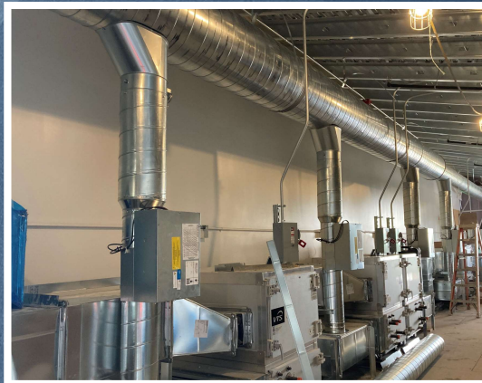
3 rd Mezz HVAC Rough-In Ongoing