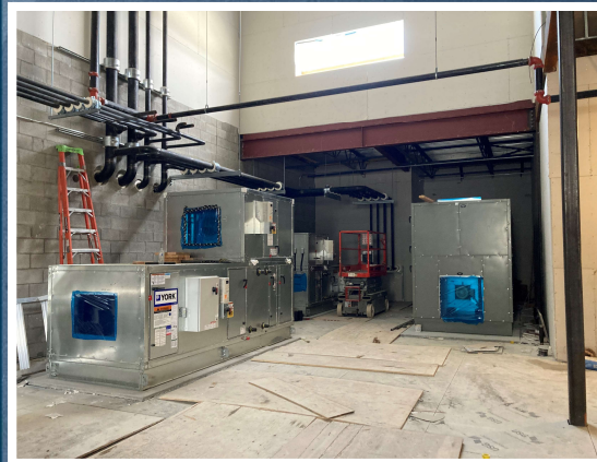
2 nd Mezz Units Set