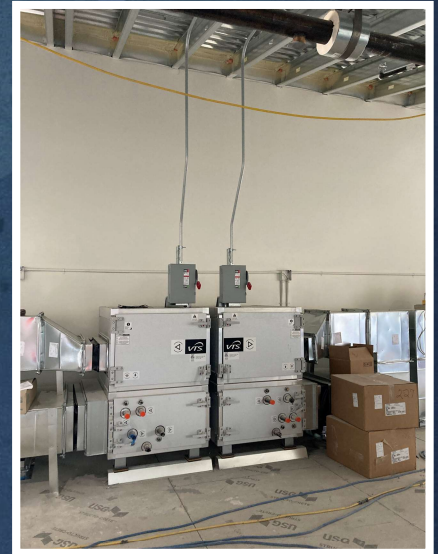
3 rd Mezz Conduit Connections