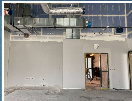
Classroom Painting Continues