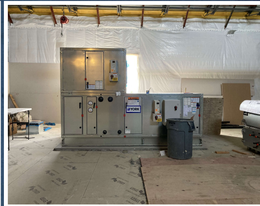
2 nd Mezz Units Set 2