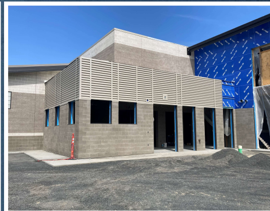
Type B Metal Wall Panels at South Exterior