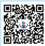
ASHK Public WeChat 添加ASHK公眾號