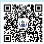
ASHK Admission WeChat 聯絡ASHK招生部查詢