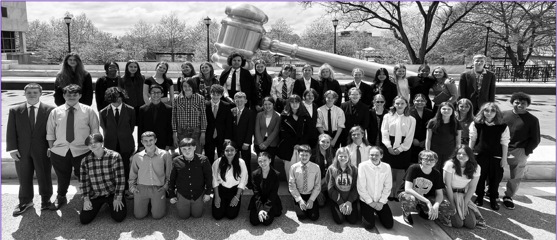
Members of Garfield and Harding middle schools' Mock Trial teams outside of the Ohio Supreme Court building in Columbus.