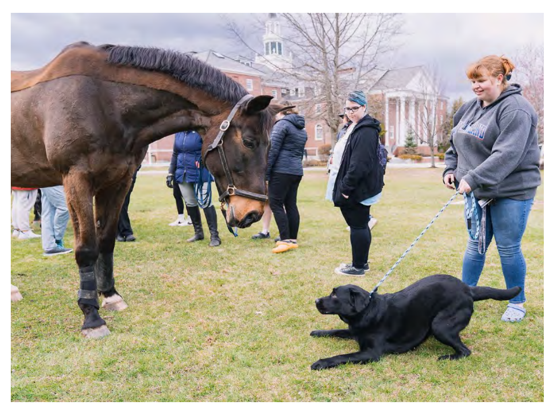
Fall 2022 Pet Therapy Program on the Quad. Chargers take it to a whole new level!