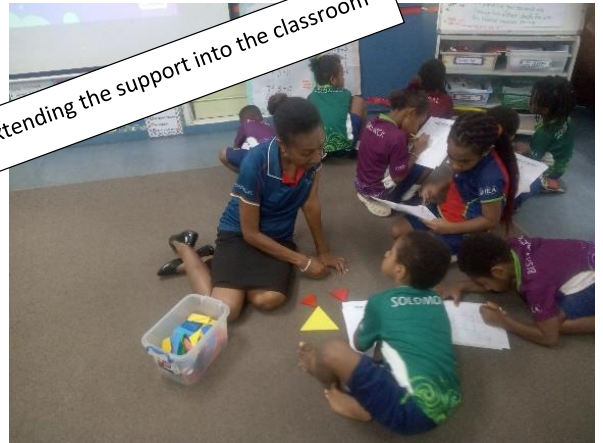
Extending the support into the classroom