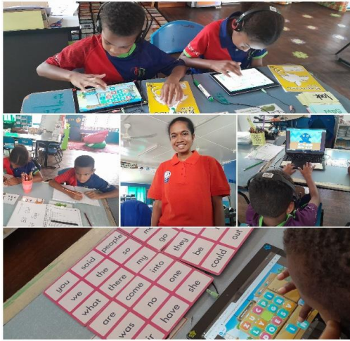
Playing the word Mania Game on Literacy Planet. Also additional help is given by providing sight words to see how many words they can make.