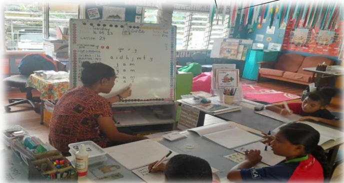
Reading vc and cvc words using single sounds (Qu, x, y)