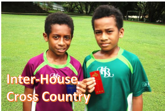
Inter-House Cross Country