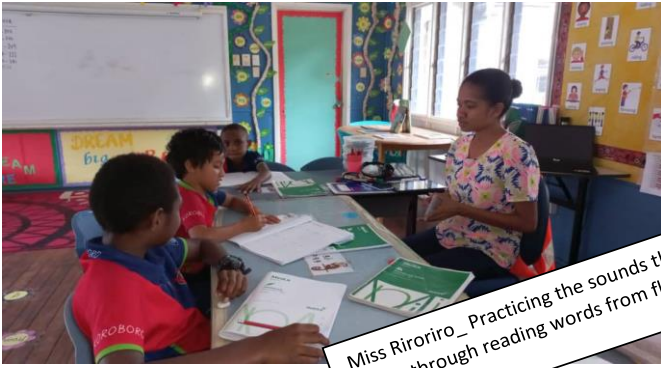
Miss Riroriro_ Practicing the sounds that they learnt through reading words from flash card.