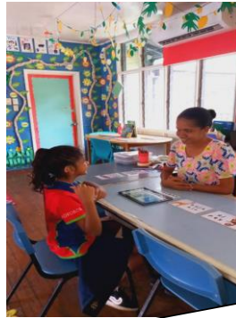
Language Development activity on Study Ladder.