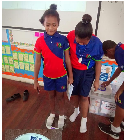
Unit of Measurements Students working collaboratively by estimating, measuring and reading their mass using weighing scale.