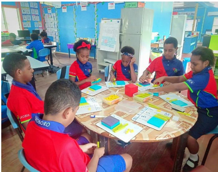
Maths Guided Group – Unit on Place Value Focus: Decimals Students using MABs to show (short represents 1/1000 th) and compare them as thousandths i.e. 128/1000 Vs. 821/1000

Here are few highlights of teaching & learning taking place in 5SA classroom.