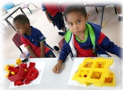
Maths- Sorting colours into correct coloured heart shape card

For weeks 3 and 4, we have been working around the heart shape. We are also excited that these activities also prepare us towards the celebration of Mothers Day .