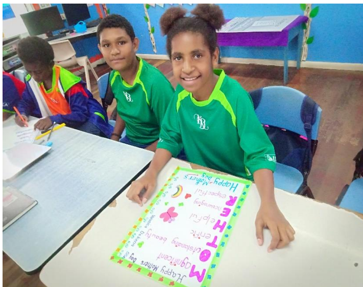
Students making Cards and Acrostic Poems for Mother's Day.