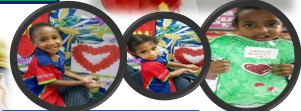
Our Mothers Blouse with captions of Happy Mothers Day and pasted hearts, These are our photo pose for our Mothers Day Card