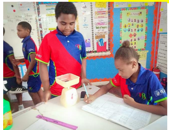
Students communicating effectively to estimate and measure mass of objects using kitchen scale.