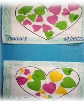
Mark Making- Collaging number 5 and large heart using different sizes of heart shapes and colour