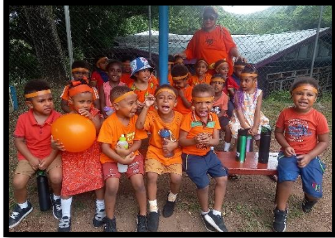
Celebrating Orange Day, the ELV way