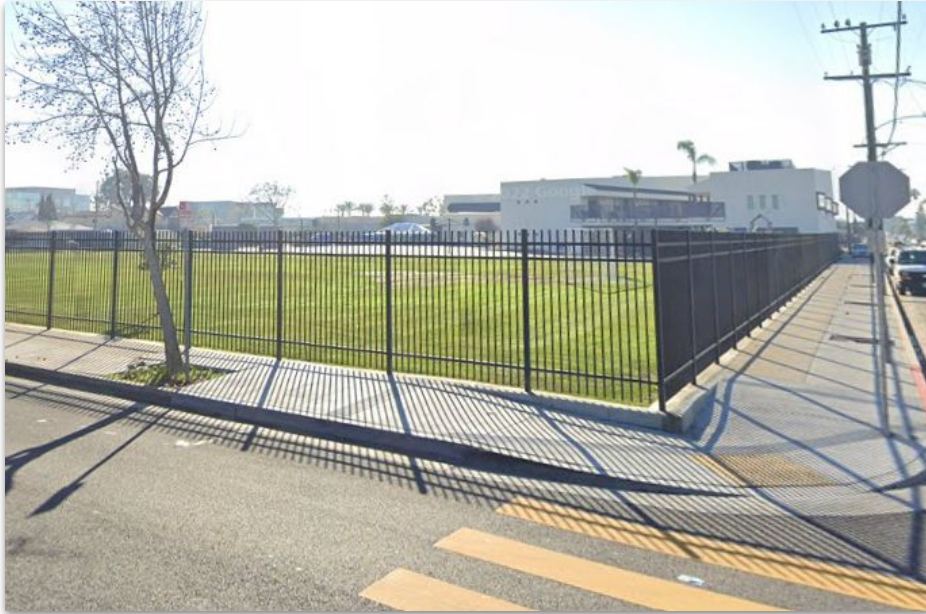
Exterior Fencing Project Design Phase