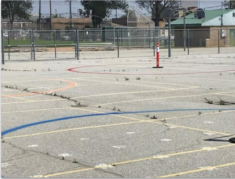
Jane Addams MS asphalt re-bidding phase