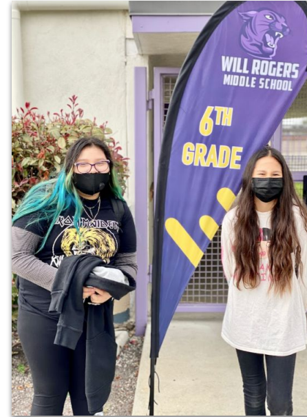
Rogers MS Administrative Building re-bidding phase