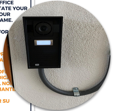
Door Buzzers All School Sites