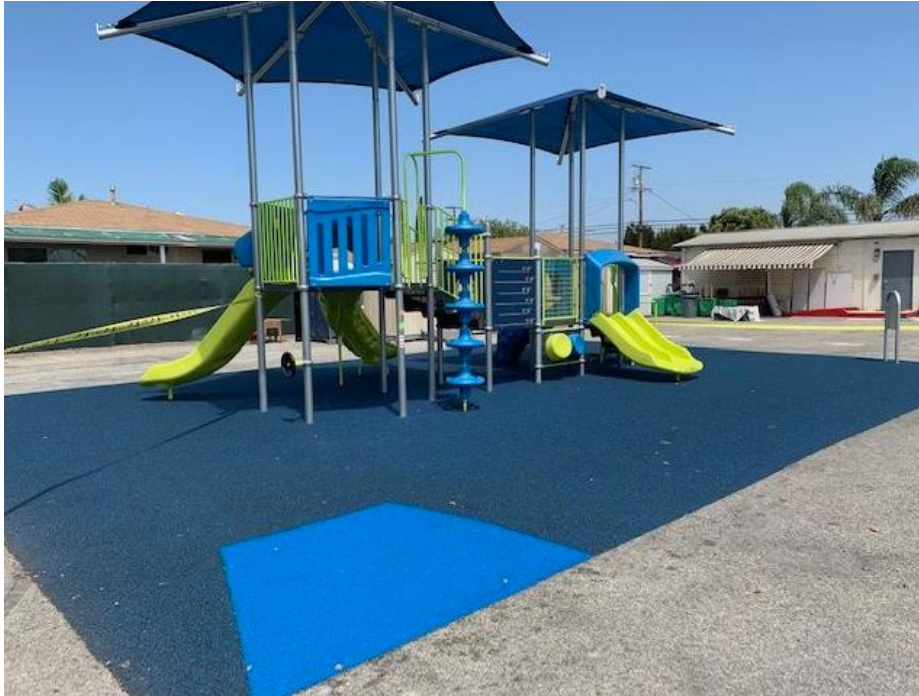
Anderson Playground $147,665.00