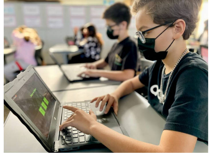
2-Story Classroom Addition at Rogers M.S.