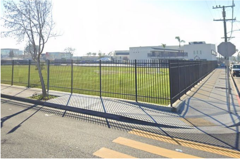
Exterior Fencing and Gates Project