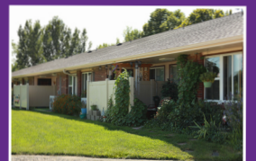
Silver Leaf I & II