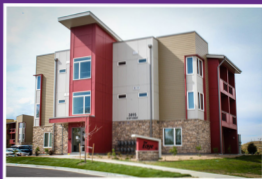
The Edge I & II