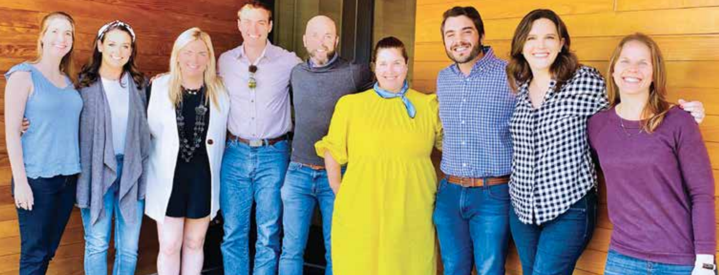
Alumni Council Members