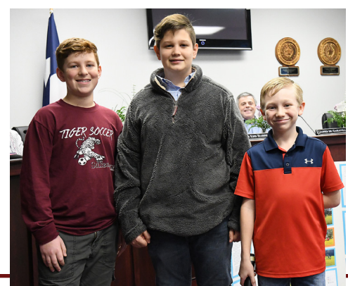
Seventh Grade Science Fair Winners