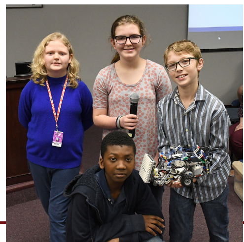
Team Robo Squad of Silsbee Middle School Robotics