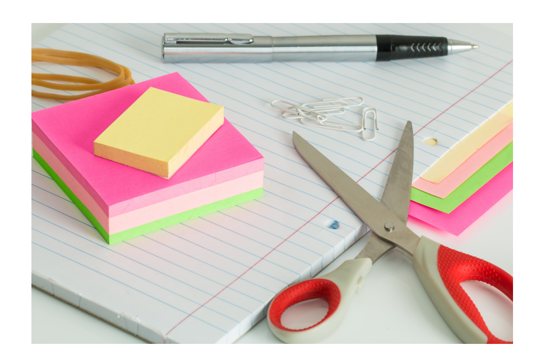
PRE-K THROUGH MIDDLE SCHOOL