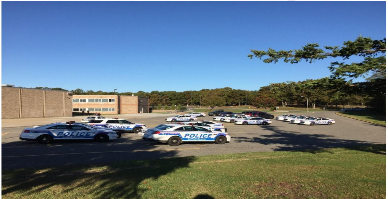
*Image taken from an emergency drill at Longwood Jr. High School

Building-Level Emergency Response Plans, which are confidential, address the following response actions as determined by the nature of the emergency. Specific response actions are explained in detail in each confidential building plan: