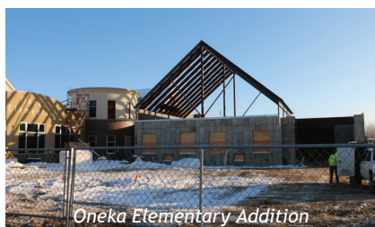
Oneka Elementary Addition