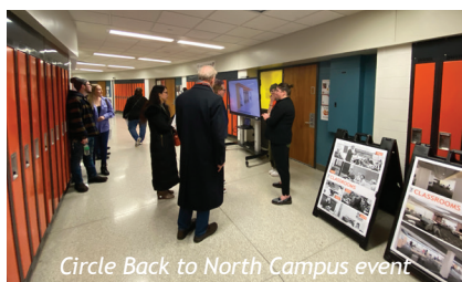
Circle Back to North Campus event