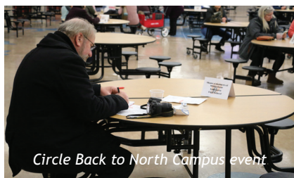
Circle Back to North Campus event