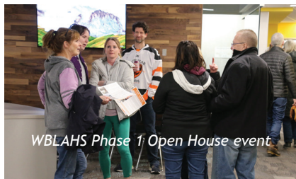
WBLAHS Phase 1 Open House event