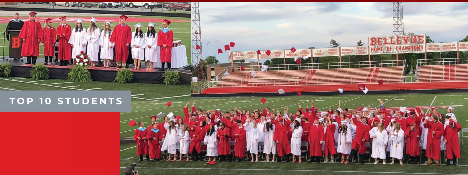
TOP 10 STUDENTS